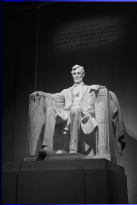
The Lincoln Memorial

Metro: Blue/Orange- Smithsonian Website: www.nps.gov/nwwm