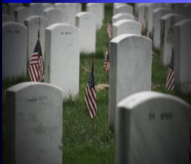
Flags at Arlington Cemetery honoring those who have served our country.

“Our Nation honors her sons and daughters who answered the call...”