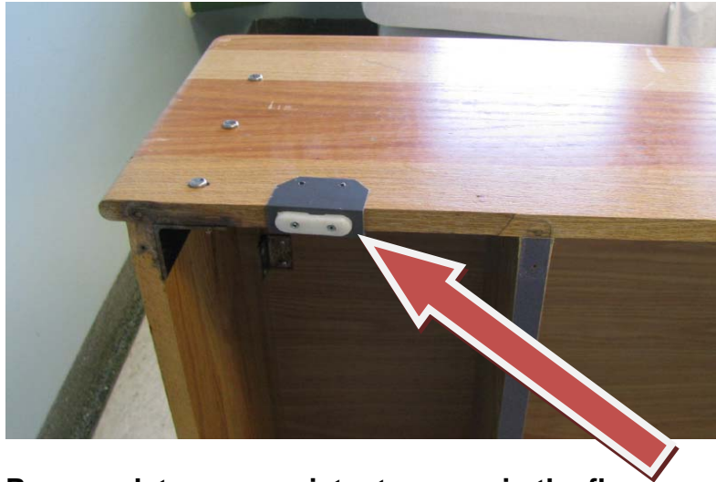
Recessed, tamper-resistant screws in the floor guard and tamper-resistant screws in the supporting frame for the floor guard

Should you decide to use tamper-resistant fasteners, consult with your Facilities Engineering Department for best practices. An example of what the reporting facility constructed is shown below.