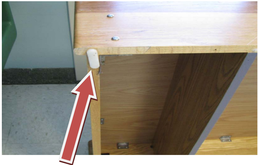
Floor guard similar to the one pulled off by the patient – originally located on the bottom of the platform bed (note that the bed frame is turned on its side)