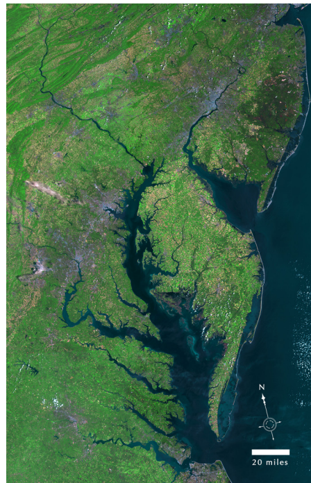
Landsat 5 mosaic of the Chesapeake Bay and its 64,000 square mile watershed.

Irrigation accounts for 80 percent of fresh water use in the U.S. Increased demand for scarce water supplies has shifted water management strategies from increasing water supply to innovatively managing water use at sustainable levels. Landsat data is regularly used to quantify water consumed by irrigation. Landsat also serves as an impartial arbitrator in water right disputes. In the western U.S. where historical water use precedent is key to water right negotiations, the retrospective looks made possible by Landsat's rich archive, appropriate spatial resolution, and thermal information (available since 1982) have made Landsat indispensable for U.S. western water resource managers. As Tony Morse, a retired geospatial technology manager from the Idaho Department of Water Resources explained, "we rely on publicly available, non-proprietary Landsat data. This means that the data for all parties to a conflict are consistently processed and equally available to all."