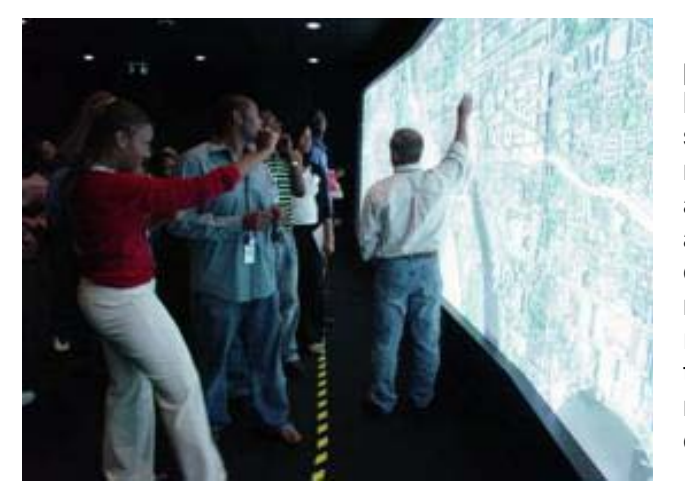
Students in the Research Alliance in Math and Science program experience the EVEREST power wall.

Atlanta and Chicago. Currently, 16 of the 10 GB circuits are committed to various purposes, allowing for virtually unlimited expansion of the networking capability. The connections into ORNL provide access to research and education networks such as ESnet, TeraGrid, Internet2, and Cheetah at 10 GB/s; Science Data Net at 20 GB/s; and National LambdaRail at 40 GB/s. ORNL operates the Cheetah research network for NSF. To meet the increasingly demanding needs of data transfers between major facilities, ORNL is participating in the Advanced Networking Initiative that provides a native 100 GB optical network in a loop which includes ORNL, Argonne National Laboratory, Lawrence Berkeley National Laboratory, and other facilities in the northeast.