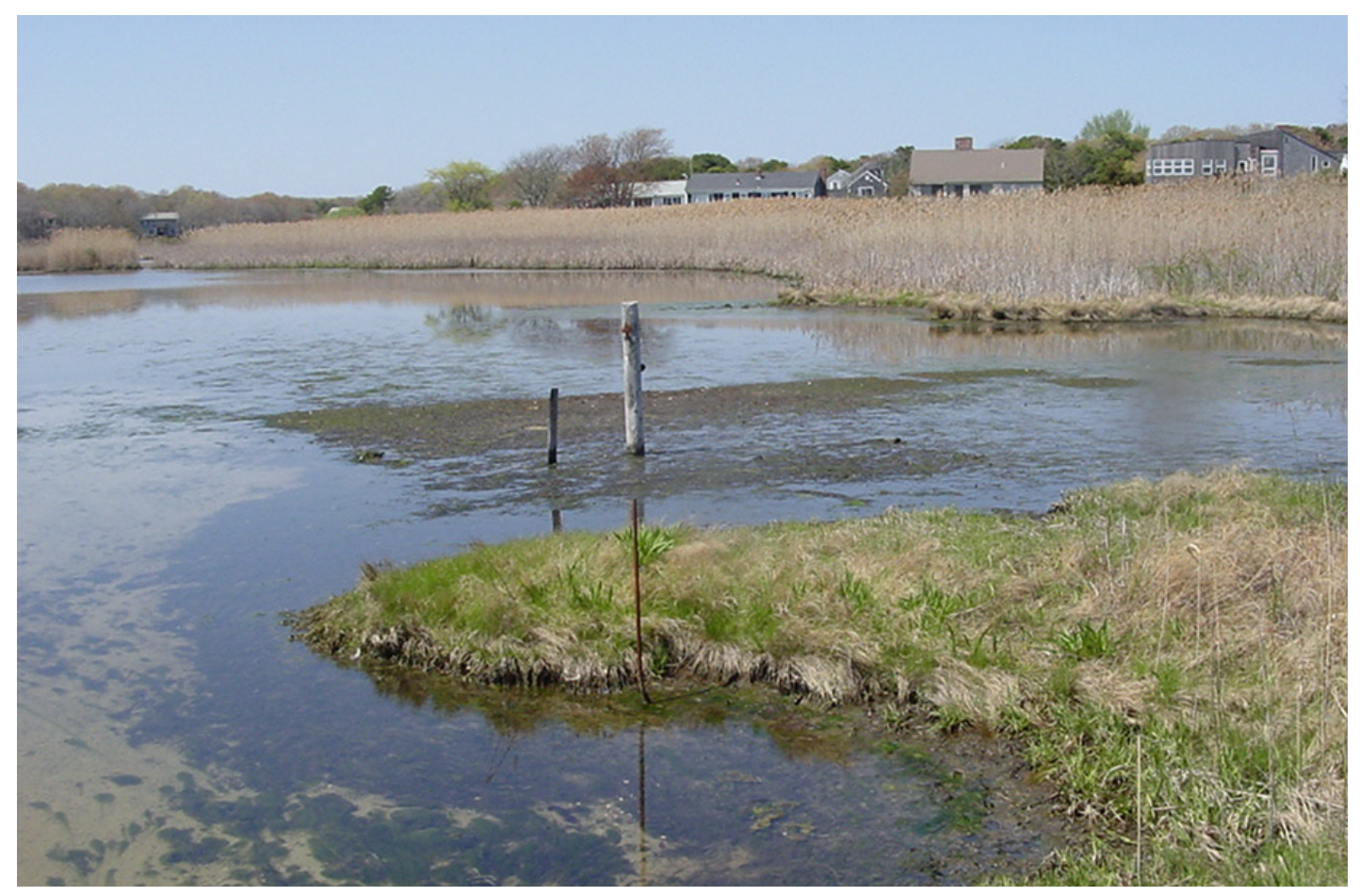
The lower east end of Stewart's Creek that is scheduled to be restored.