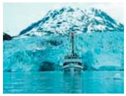
In Glacier Bay, Alaska