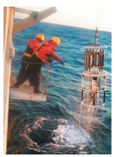
Crew members retrieve oceanographic instrument

Albatross IV continues the long scientific tradition of the Albatross I, Albatross II, and Albatross III. Albatross vessels have been operating out of Woods Hole since the Nation's first biological station was established here in 1871, when the Albatross I was built as the first fishery research vessel.