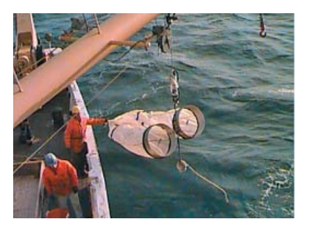
Some of the methods used to collect fishery data