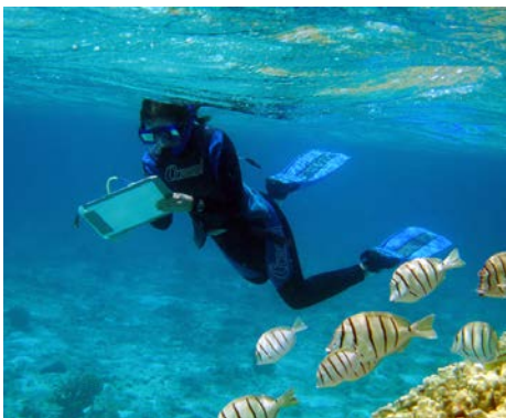
Diver doing a fish count