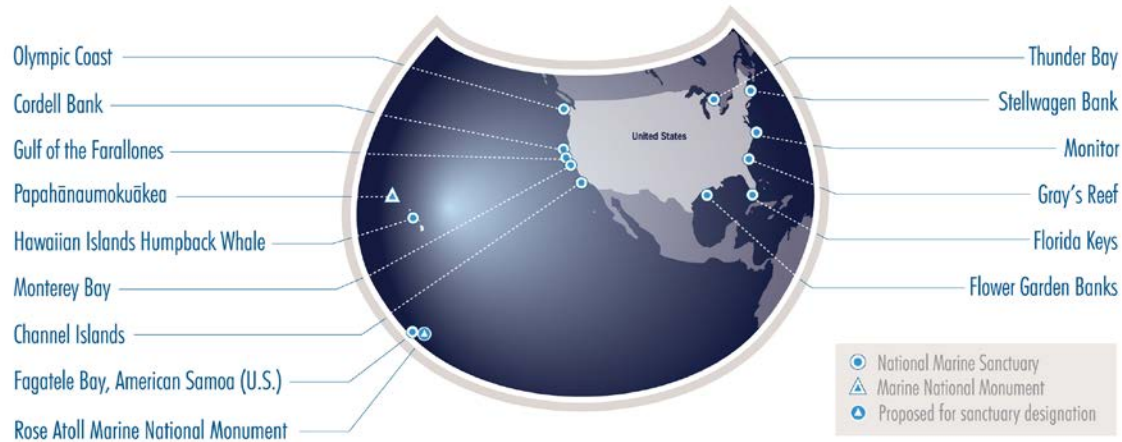
Scale varies in this perspective. Adapted from National Geographic Maps.