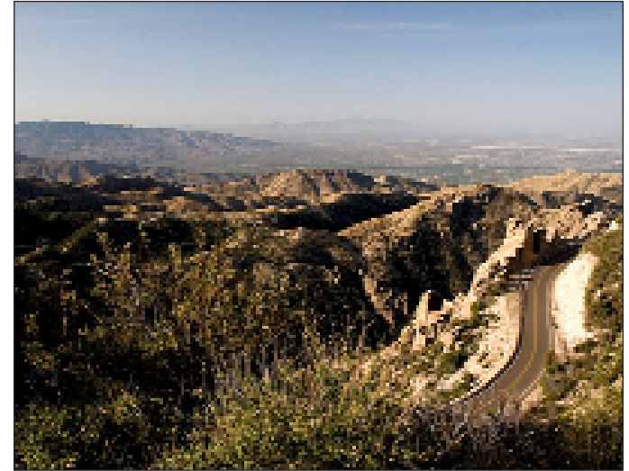
General Hitchcock Highway

Saddle Road. In 1991, planning began for the reconstruction of a 48.5 mile portion of the Ala Mauna Saddle Road (HI State/County Route 200), which connects Hilo to Waimea on the Big Island of Hawaii. Saddle Road, the most direct route between the east and west sides of the island, has one of the highest accident rates of any road of its classification in Hawaii. The Saddle Road improvement project will make the road safer and easier to use by eliminating narrow lanes, improving lines of sight, eliminating numerous roadside hazards such as bridge parapets and rough road edges. The Hawaii Department of Transportation requested that CFLHD be the lead agency for project development and construction of the Saddle Road improvement project. Nearly $80 million in contracts have been awarded for the first three phases of the project. Construction funding for the Saddle Road improvements have been made available from multiple Federal Lands Highway Program sources. Construction of the remainder of the Saddle Road project will be phased as funds become available.