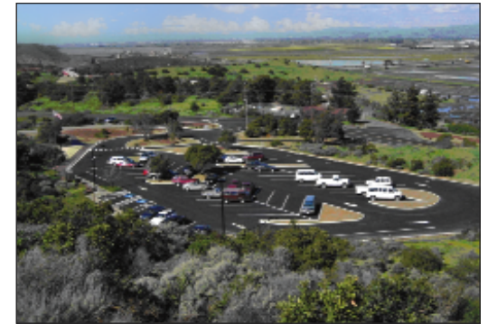
Don Edwards National Wildlife Refuge, California

Roads, Indian Reservation Roads, Defense Access Roads, and other Federal lands roads. CFLHD also provides training, technical assistance, environmental support, planning and asset management, technology deployment, and engineering services to deliver programs, projects, products, and services to other partners and customers.