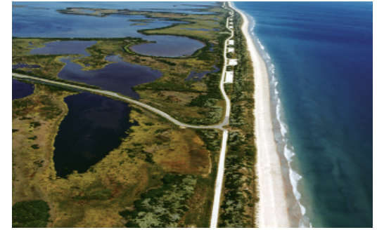
Canaveral National Seashore

Reservation Roads, Defense Access Roads, and other Federal lands roads. EFLHD also provides training, technical assistance, environmental support, planning and asset management, technology deployment, and engineering services to deliver programs, projects, products, and services to other partners and customers.