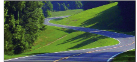
Natchez Trace Parkway

Foothills Parkway. The National Park Service has been working in partnership with Eastern Federal Lands to construct the 72 mile Foothills Parkway, which traverses the northern and western perimeter of Great Smoky Mountains National Park in Tennessee, since the 1960s. Construction of the parkway began in 1960, with the majority of work, in 3 sections totaling 23.4 miles, completed by 1970. Currently, the emphasis is on the completion of a 16.1 mile section, in a topographically difficult area, including a number of bridges. The parkway will provide millions of tourists with breathtaking vistas of the mountains.