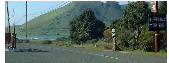
Don Edwards San Francisco Bay National Wildlife Refuge, California (Refuge Roads)