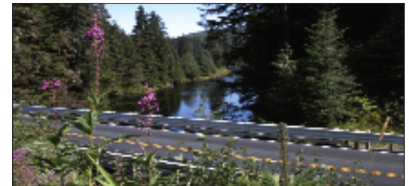
Tongass National Forest, Alaska (Forest Highways)