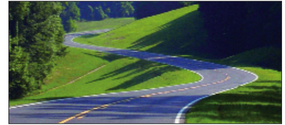
Natchez Trace Parkway, Mississippi (Park Roads)