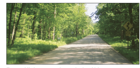
Forest Highway 22 through the Chippewa National Forest in Minnesota (FH)