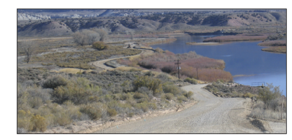
Browns Park National Wildlife Refuge in Colorado (RR)