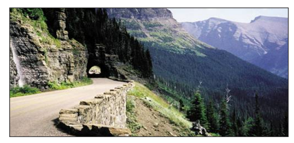
Going to the Sun Road in Glacier National Park in Montana (PRP)