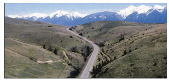
US Highway 93 through the Flathead Indian Reservation in Montana (IRR)