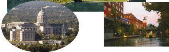
Oklahoma City Skyline