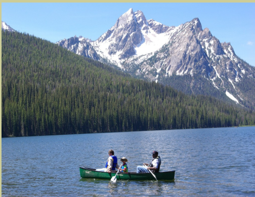
Stanley Lake in the Sawtooth Mountains

There is an active arts community featuring the Idaho Shakespeare Festival at a beautiful outdoor amphitheater near the Boise River, The Boise Contemporary Theater, The Boise Philharmonic, The Boise Art Museum, and Ballet Idaho. Bogus Basin Ski Resort is a short drive and there are many miles of biking/hiking trails within minutes of the hospital grounds.