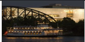
Clinton Presidential Library and the Arkansas Queen Riverboat