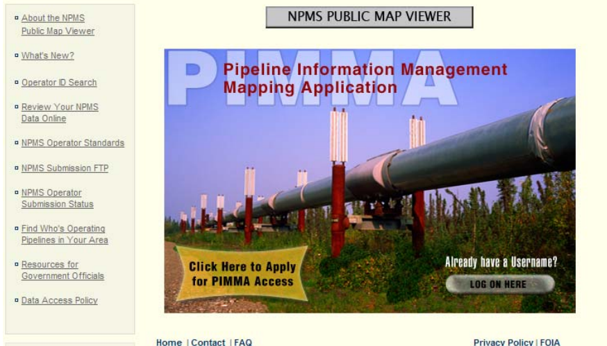
NPMS Home Page

Click here for more info on NPMS Data Requests