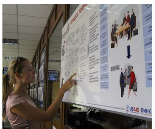
A visitor browses through the one-stop shop materials