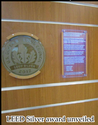
LEED Silver award unveiled