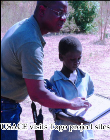
USACE visits Togo project sites