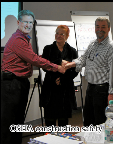
OSHA construction safety