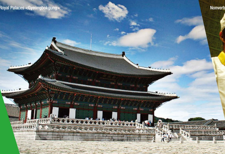
Five Royal Palaces <Gyeongbokgung>