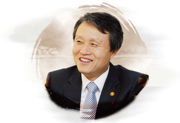
H.E. Kwon Do-Youp Minister Ministry of Land, Transport and Maritime Affairs Republic of Korea