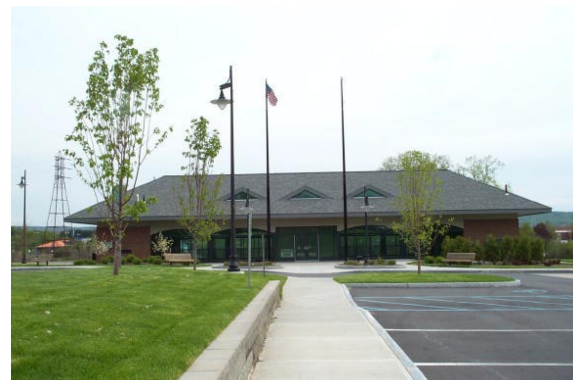
Historic Marina Project in Utica, NY