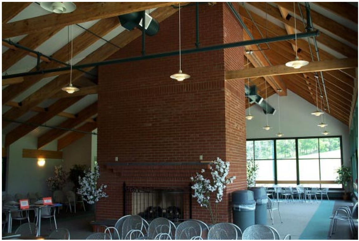
Ski chalet at Parkway Recreation Center Project in Utica, NY. Renovated with CDBG Funds.