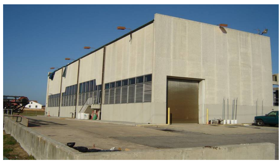
Pump Station JP #1