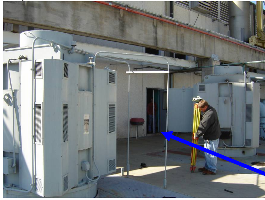
JP #4 first floor 14.52 feet