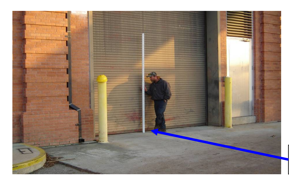
OP #6 first floor #2 1.43 feet