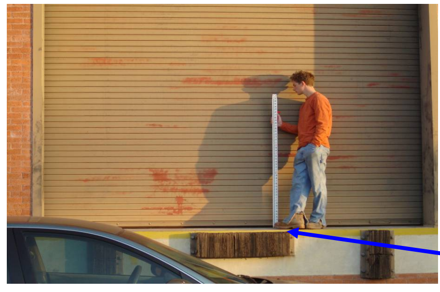
OP #6 first floor #3 5.33 feet