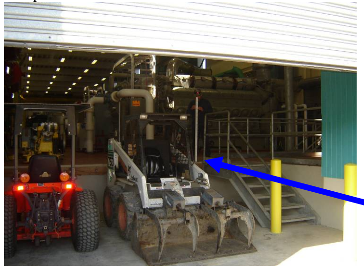
Pump Station JP #2