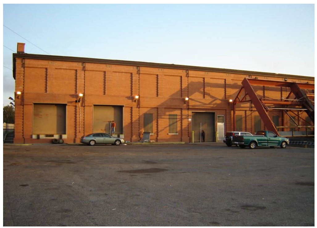
OP #6 Pump Station