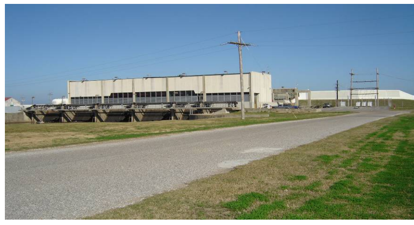
Pump Station JP #4