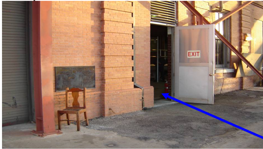
OP #6 first floor 2.48 feet