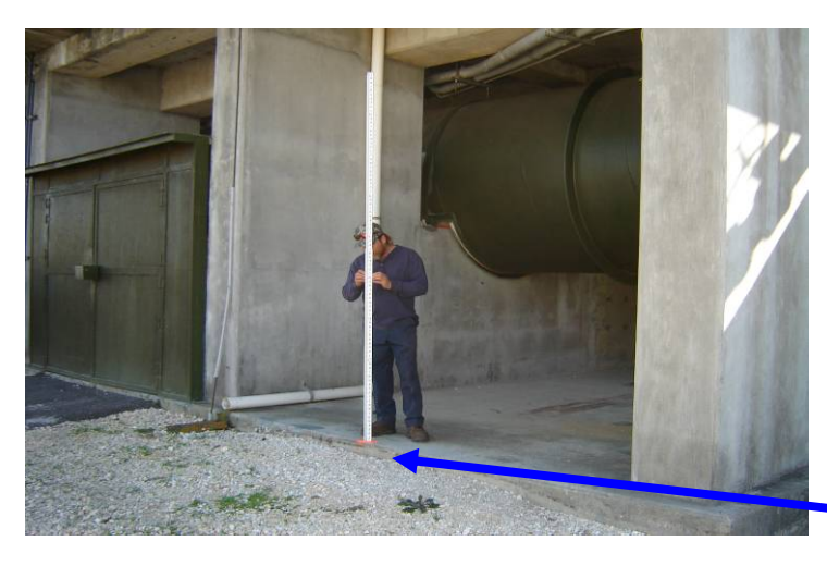
PL first floor #2 6.95 feet