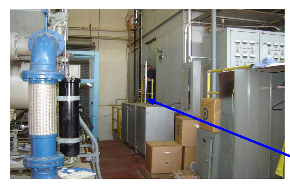
JP #4 first floor #2 11.04 feet