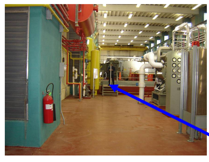
JP #2 first floor 9.60 feet