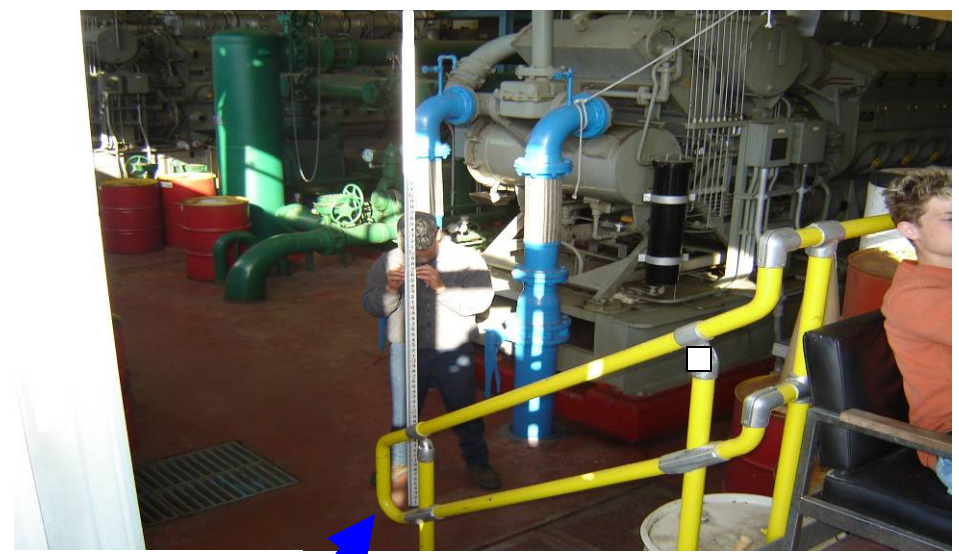
JP #1 first floor shot 9.83 feet.