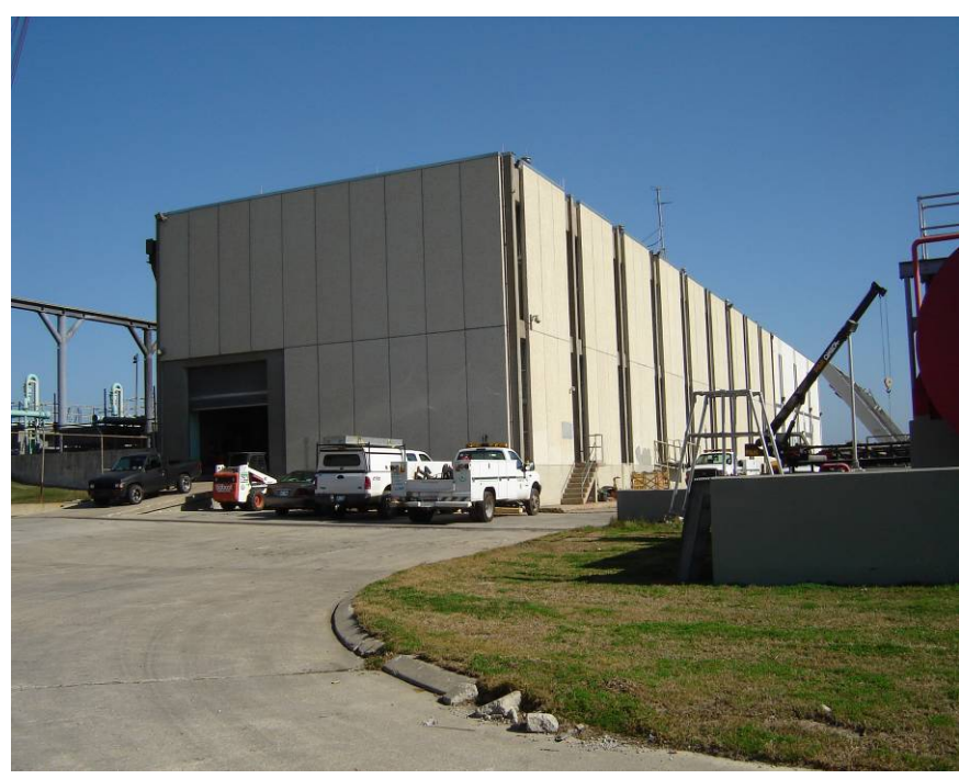
JP #3 Pump Station