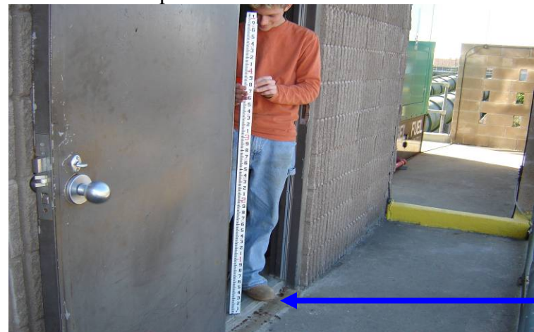
PL first floor 21.94 feet