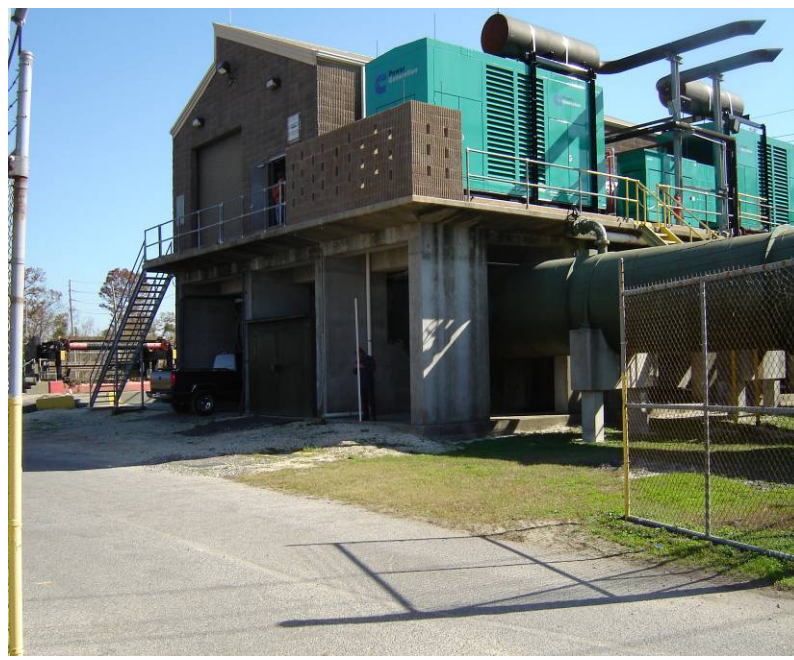
Parish Line Pump Station