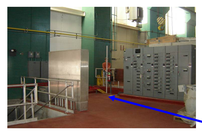
JP #3 first floor 15.55 feet