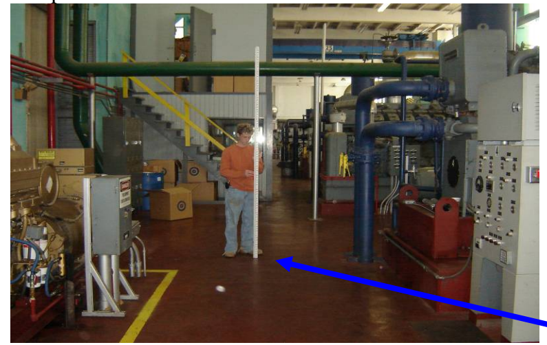
JP #3 first floor 16.67 feet