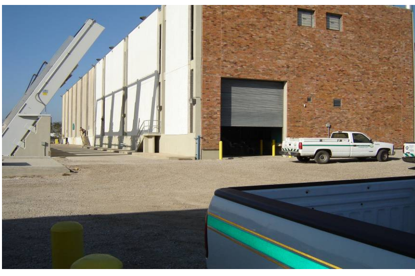
Pump Station JP #2