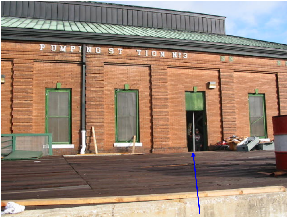
Finished Floor 1.230 feet NAVD88 2004.65 Field Book 060851