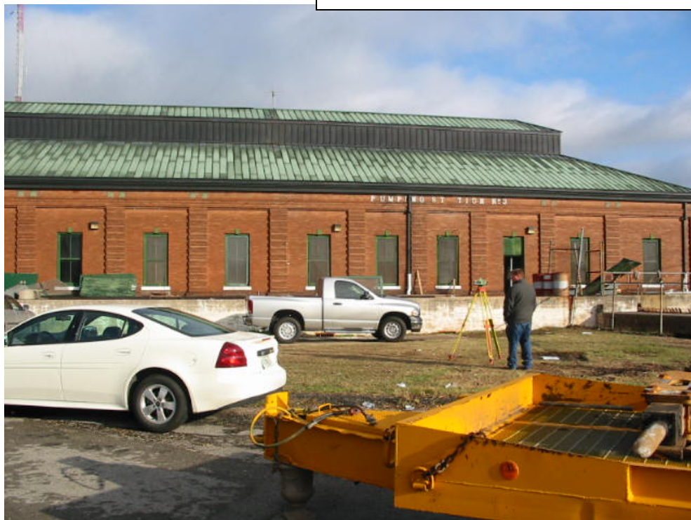
OP #3 PUMP STATION