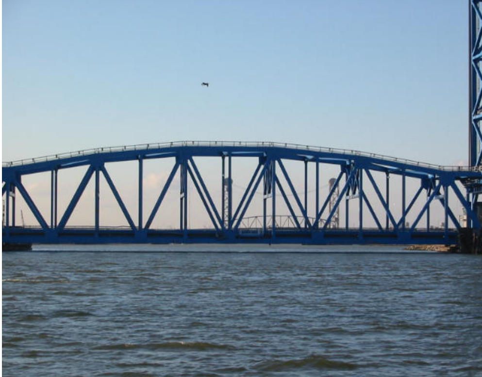
Low Chord Florida Ave Bridge 4.14 feet NAVD88 2004.65 Field Book 060858