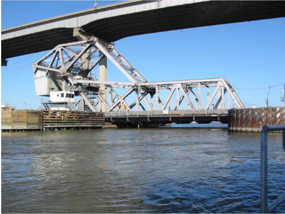
Low Chord IHNC #2 Almonaster Bridge 3.506 feet NAVD88 2004.65 Field Book 060851