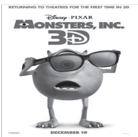
Monsters Inc. 3D "G" Saturday, 7 p.m.