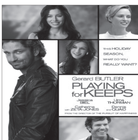
Playing for Keeps "PG13" Wednesday, 7 p.m.

Tickets: $4 for adults; $2.50 for children age 6-11 and free for children younger than 5. Cash only.