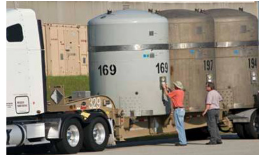
Preparing a shipment of TRU waste in TRUPACT IIs for shipment to WIPP.

Since the majority of SRS waste containers were filled prior to the issuance of WIPP Waste Acceptance Criteria (WAC), nearly 30 percent of the drums and all of the miscellaneous waste containers require repackaging and the removal of prohibited items.