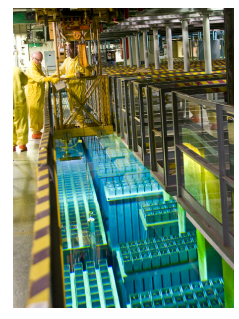
LAC employees move a fuel assembly to its storage location in L Basin.

The Savannah River Site is owned by the U.S. Department of Energy, and is managed and operated by Savannah River Nuclear Solutions.