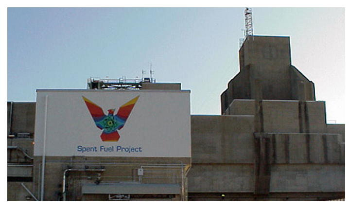
The L Area Complex

L Basin has concrete walls two and a half to seven feet thick and holds approximately 3.5 million gallons of water with pool depths of 17 to 50 feet. All used fuel assemblies are "cool" enough to be safely stored without an active basin water cooling system. The basin water provides shielding to protect workers from radiation.