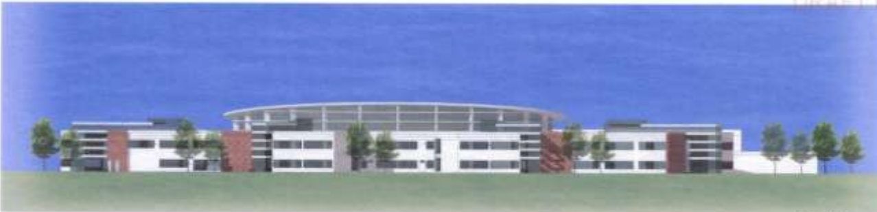
SÜDANSICHT SOUTH ELEVATION