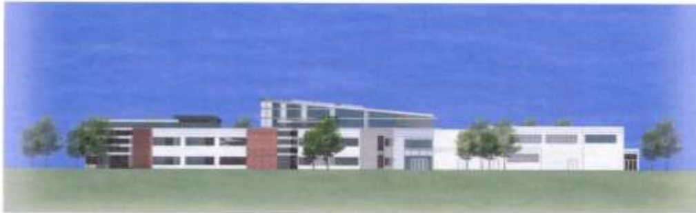
OSTANSICHT EAST ELEVATION