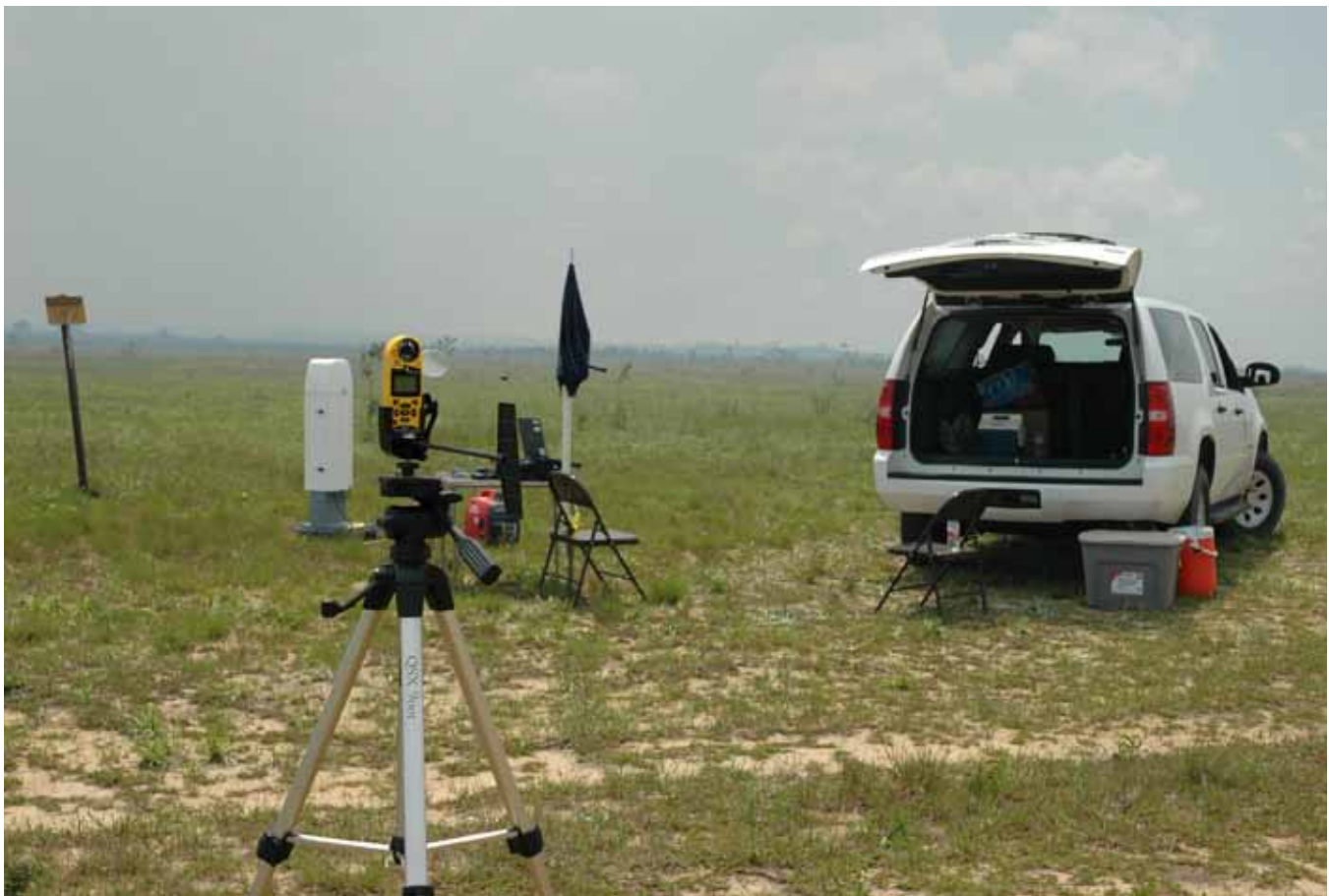
Particulate matter can be monitored in the field to validate smoke models.

The JFSP has long been supporting research in this arena and has made it a greater priority since the 2007 roundtables. For example, one recently completed study was aimed at evaluating and improving Daysmoke, a smoke plume rise model (JFSP Project No. 08-1-6-06). Plume height is an important factor in estimating long-range transport of smoke and is needed for running regional air quality models, such as the EPA Community Multiscale Air Quality Modeling System (CMAQ). The researchers improved Daysmoke predictions by incorporating additional key