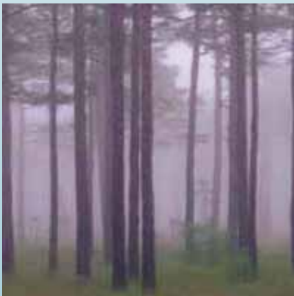
Superfog. ( http://www.srs.fs.usda.gov/pubs/su/021/threats.htm )

Superfog is extremely dense fog that results from the addition of moisture to air that is already very humid. The moisture in a smoke plume is one possible source. The combination of the plume's moisture with that of the air can result in a condition referred to as supersaturation, which produces very dense fog that hangs close to the ground and can cause serious