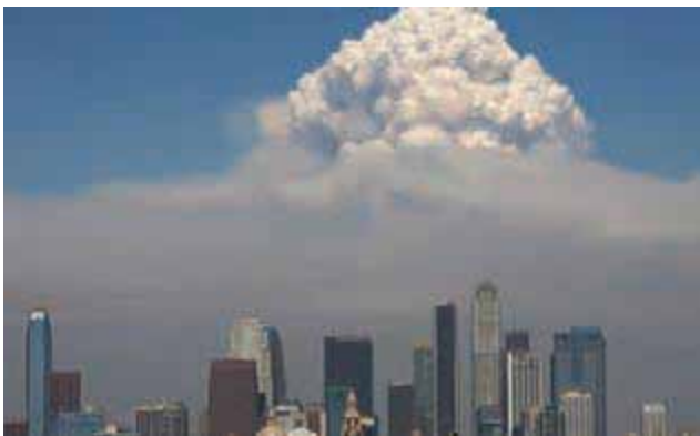
Smoke from the Station Fire above Los Angeles in September 2009. ( http://www.epa.gov/region9/annualreport/10/epa-progress-report-2010.pdf )

Currently, there is very little understanding of the levels of smoke that are acceptable to the public in