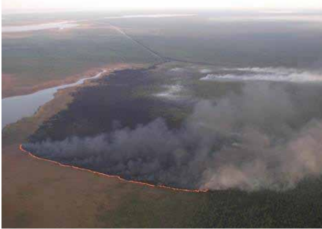
Fires burning in ecosystems with deep organic soils can smolder for weeks and produce significant amounts of black carbon. JFSP Project No. 08-1-3-03 final report.