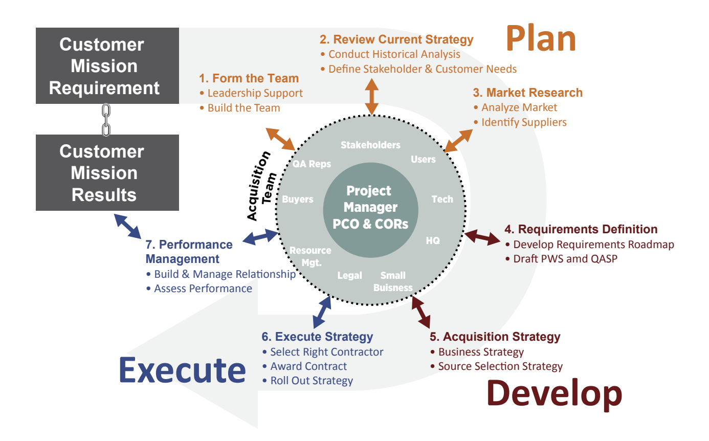
Figure 1. Services Seven-Step Acquisition Process

time for customers' and stakeholders' input as well as building a solid acquisition team supporting the development, execution, and assessment of this requirement through the service acquisition life cycle.