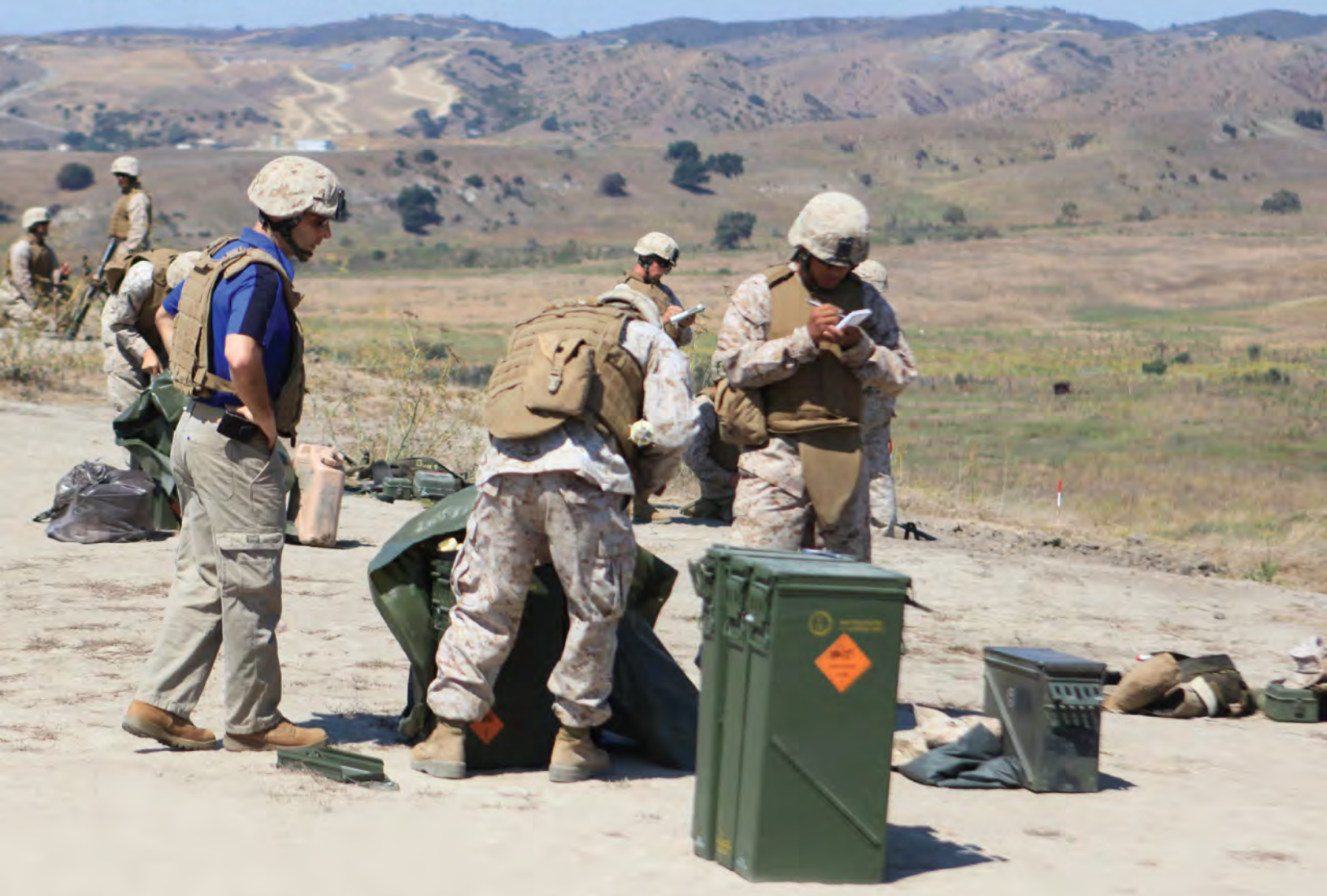
U.S. Marines prepare mortars, while individuals with the DoD Non-Lethal Weapons Program gather information to support development of a potential non-lethal round.

The DoD Non-Lethal Weapons Program fiscal year 2011 budget was approximately $138 million. This budget included Joint funding executed under the direction of the Executive Agent for a wide range of program activities including non-lethal weapons research and development, as well as Service funding for non-lethal weapons procurement, operation and maintenance support.