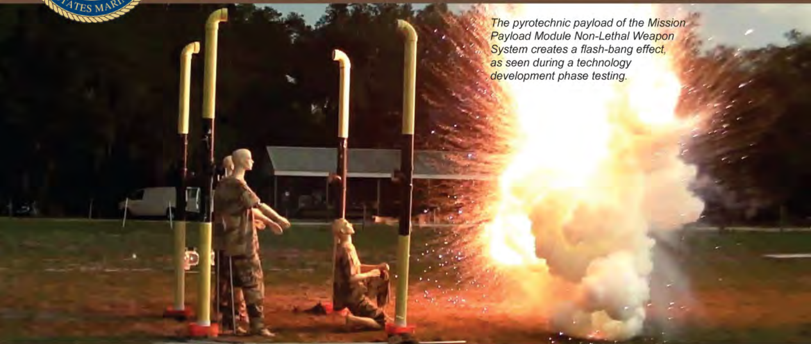
The pyrotechnic payload of the Mission Payload Module Non-Lethal Weapon System creates a flash-bang effect, as seen during a technology development phase testing.

Central Action Officer 703-784-2300 DSN: 278-2300