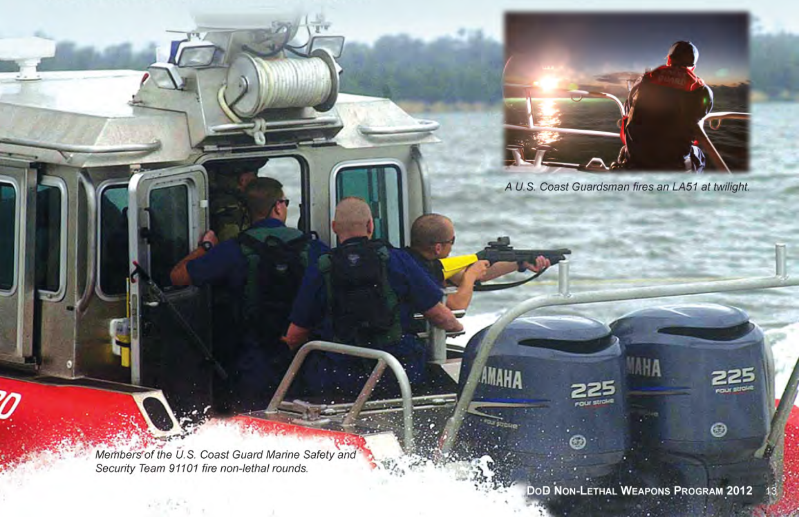
Members of the U.S. Coast Guard Marine Safety and Security Team 91101 fire non-lethal rounds.