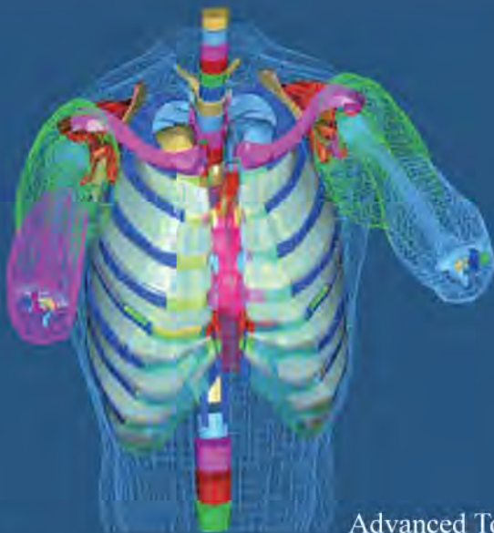
Advanced Total Body Model – Analyzes blunt trauma