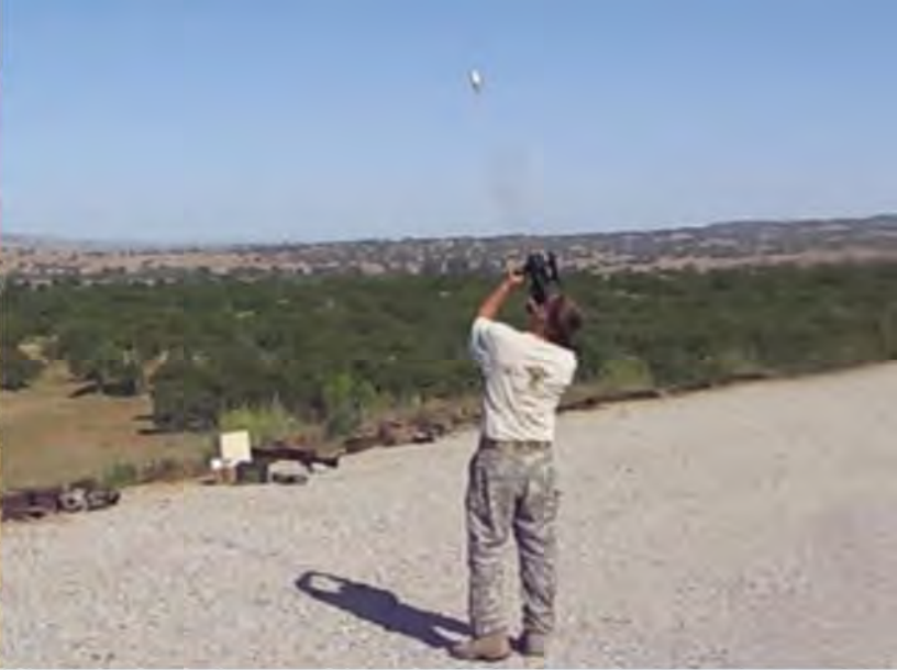
U.S. Special Operations Command: A U.S. Army Soldier fires a hail and warn munition of Harbinger, a non-lethal weapon escalation-of-force family of systems.

non-lethal weapons exercises included Joint Patriot, a multi-agency, annual homeland defense-training event sponsored by the National Guard Bureau, and Vigilant Shield, a synchronized response exercise to homeland threats held in coordination with Canadian forces.