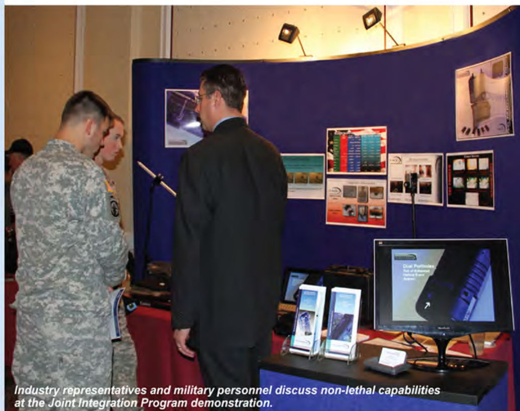
Industry representatives and military personnel discuss non-lethal capabilities at the Joint Integration Program demonstration.

The Department of Defense Non-Lethal Weapons Program appreciates organizations that are interested in furthering the development of the next generation of non-lethal weapons. Visit http://jnlwp.defense.gov/ to access U.S. government and military solicitations related to non-lethal weapons.