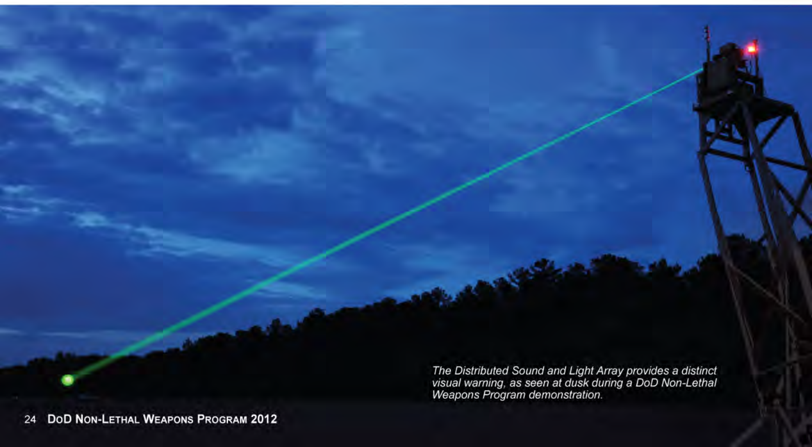
The Distributed Sound and Light Array provides a distinct visual warning, as seen at dusk during a DoD Non-Lethal Weapons Program demonstration.

Other emerging non-lethal weapon capabilities demonstrated this year include the 40mm Human Electro-Muscular Incapacitation projectile and radio frequency directed energy for vessel stopping.