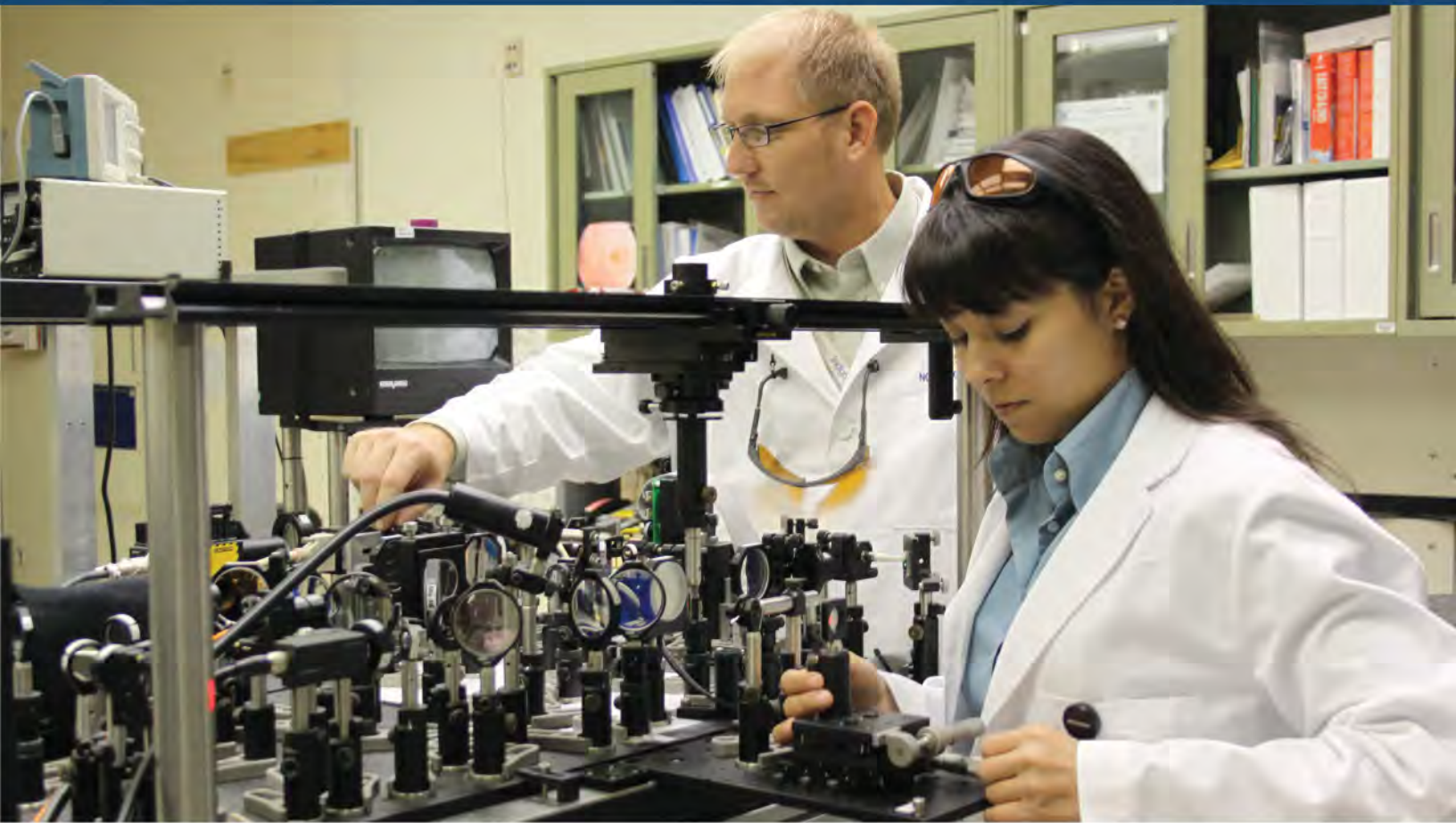
711th Human Performance Wing of the Air Force Research Laboratory scientists configure test equipment for a laser experiment. Results from this and similar research are essential for the development and fielding of non-lethal weapon capabilities.

Central to the DoD Non-Lethal Weapons Program human effects efforts is the Human Effects Center of Excellence , referred to as HECOE.