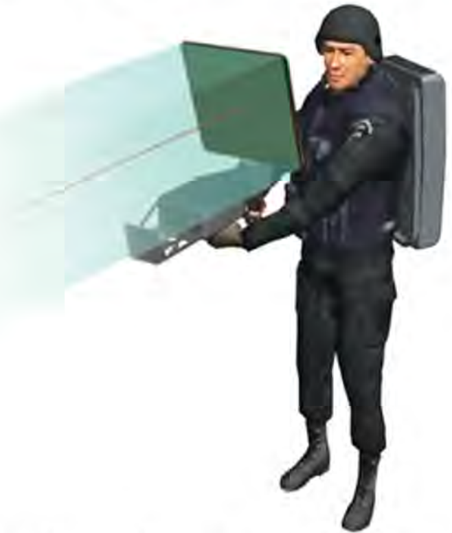
The above Department of Justice conceptual illustration depicts the Directed Energy Portable Radio Frequency Less-Lethal Device.

The DoD Non-Lethal Weapons Program is interested in enhancing inter-agency communication and