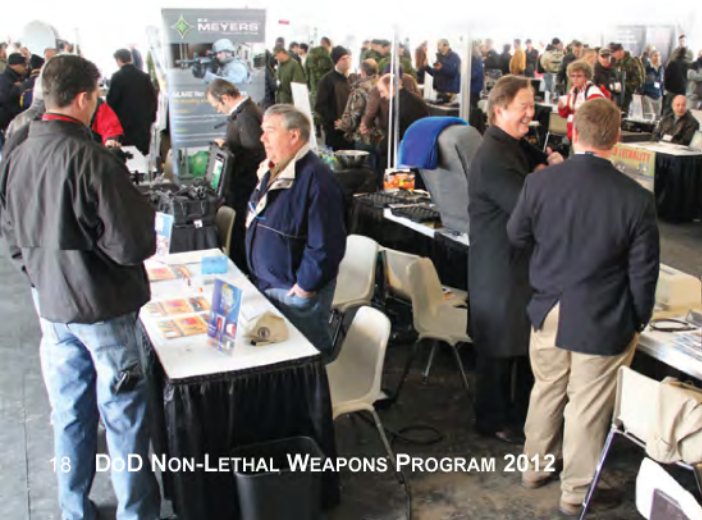
Connaught Range in Ottawa, Canada, was the site of non-lethal capability demonstrations during the North American Technology Demonstration. (below) The Active Denial System was showcased during vignettes at the North American Technology Demonstration. (right)