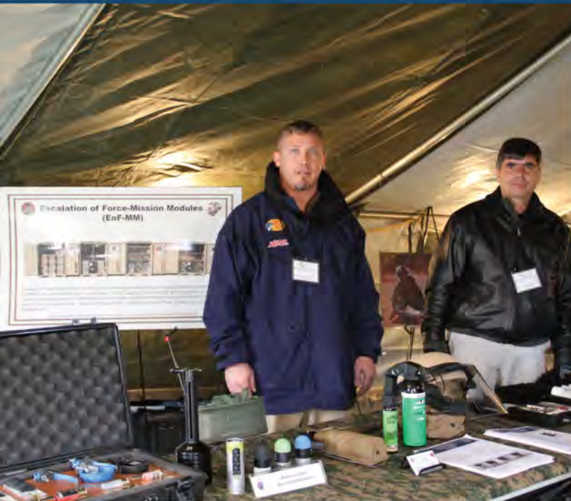
Outreach efforts are ongoing, including this display of the Escalation-of-Force Mission Modules at the North American Technology Demonstration Non-Lethal Capabilities International Trade Show and Conference in Ottawa, Canada.