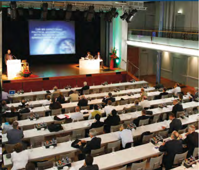
Conference attendees learn about the benefits of non-lethal capabilities at the 6th European Symposium on Non-Lethal Weapons.

The Department of Defense Non-Lethal Weapons Program routinely engages with a variety of groups to inform others about non-lethal weapons, devices, and munitions, and the potential capability they provide our military forces. These engagements also ensure accurate information is provided, and that the DoD Non-Lethal Weapons Program is kept abreast of currently available and emerging technologies. Highlights include: