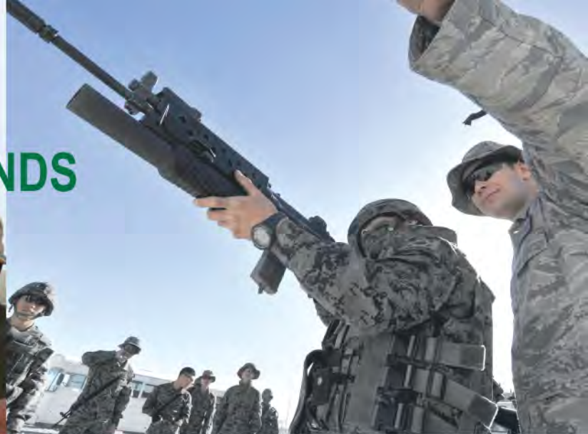
U.S. Central Command: A U.S. Air Force Expeditionary security forces Airman watches a South Korean Security Forces soldier fire a non-lethal 40mm sponge round during M203 grenade launcher training in Afghanistan.

U.S. Combatant Commanders understand the important role that non-lethal weapons play in reducing civilian casualties, protecting critical infrastructure, and reducing U.S. reconstruction costs — critical elements in many of today's operations.