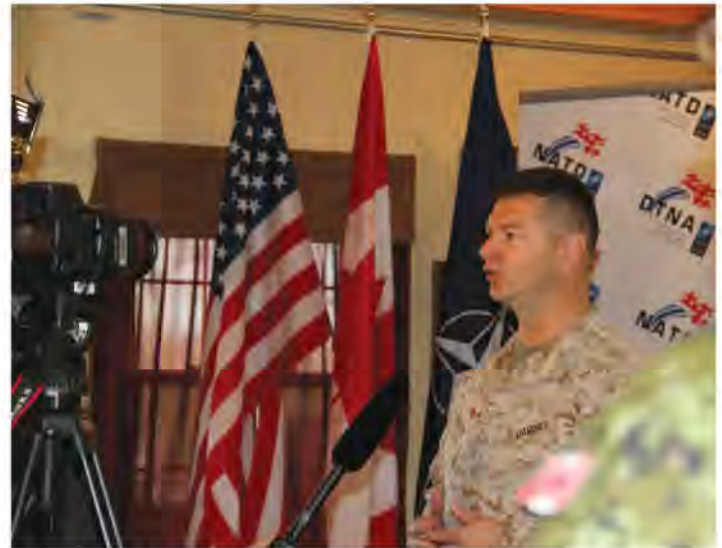
Colonel Tracy J. Tafolla addresses the media at the North American Technology Demonstration Non-Lethal Capabilities International Trade Show & Conference.

Non-lethal weapons help provide that additional flexibility and adaptability, and are a valuable adjunct to the use of lethal force. They provide a “de-escalation-of-force” option between shouting and shooting. They assist forces to determine intent of advancing personnel prior to employing lethal force, or to segregate, isolate, and then incapacitate combatants hiding among civilians. Fielded non-lethal weapons reduce damage to property, while future systems offer promising force application effects that minimize damage to critical infrastructure. In addition to reducing collateral