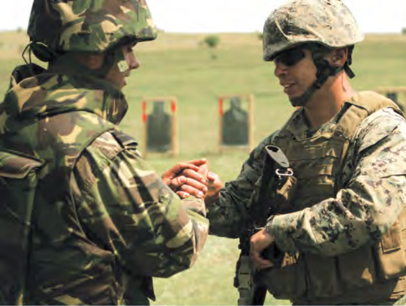
U.S. European Command: A Romanian soldier thanks a U.S. Marine Corps Black Sea Rotational Force 11 rifleman for allowing him to use the Marine's rifle, which fired non-lethal rounds.