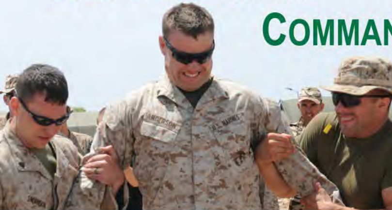
U.S. Africa Command: A U.S. Marine Corps Military Policeman receives an electrical shock from a TASER® during non-lethal weapons training at African Lion 2011.