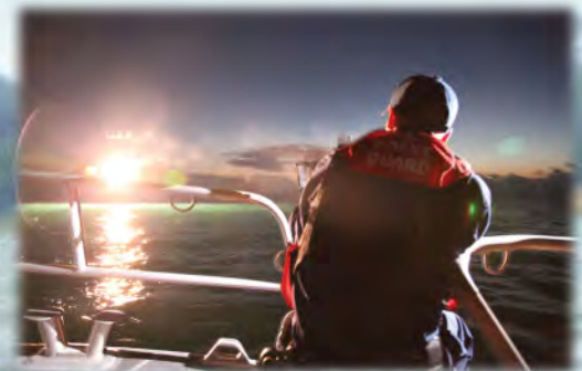
A U.S. Coast Guardsman fires an LA51 at twilight.

The LA51, officially titled Less Lethal Warning Munitions, is a two-part, 12-gauge shotgun munition. The first part is a standard casing and charge that can propel the round up to approximately 100 yards. The second part, the projectile, includes pyrotechnics and a timer, which delays the non-lethal effects. When the munition detonates, it delivers a loud bang and brilliant flash.