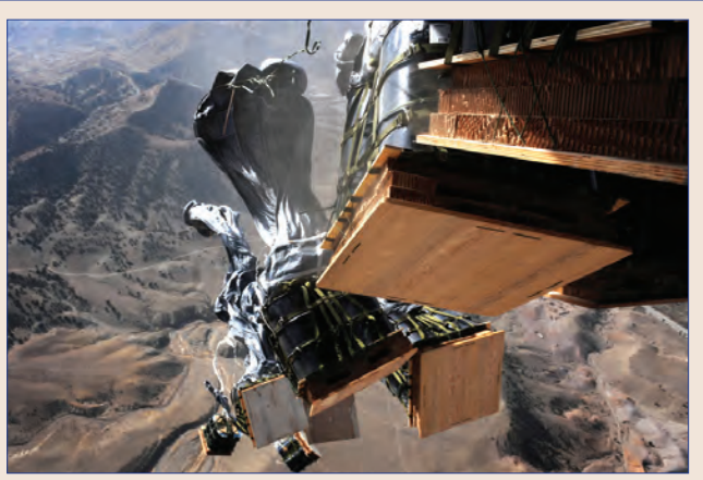
Forty bundles of fuel fall from a U.S. Air Force Globemaster III aircraft over Afghanistan, Dec. 8, 2010. The aircraft is assigned to the 816th Expeditionary Airlift Squadron.

The means for reducing demand and improving efficiency are both materiel and non-materiel: the DoD Components must invest in new technologies and equipment but also in new practices and behaviors. For example, the Department is considering technological options that will increase military effectiveness and also reduce energy demand, such as unmanned aerial vehicle delivery for cargo. At the same time, the Air Mobility Command (AMC), which operates the airlift and refueling aircraft that are critical to U.S. global reach, is looking at policy changes that will achieve similar