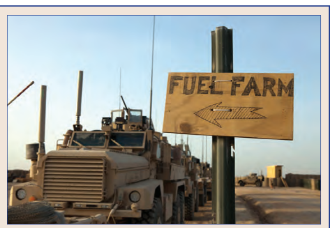
A posted sign in front of parked Cougar H 6x6 vehicles points to the direction of the fuel farm at the forward arming and refueling point (FARP) in Combat Outpost Ouellette, Afghanistan, April 4, 2011. The FARP serves as a re-fueling and re-supplying station for various Marine components in support of Operation Enduring Freedom.

Through the Defense Logistics Agency-Energy (DLA-Energy), military logistics forces, and private sector partners, the DoD