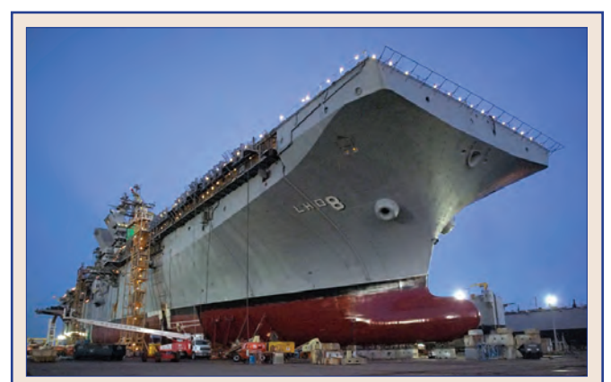
A bow view of the USS Makin Island (LHD 8) under construction in Pascagoula, Miss. The USS Makin Island is the Navy's first amphibious assault ship equipped with an all electric auxiliary system and a hybrid gas turbine - electric propulsion system. On her maiden voyage, her hybrid drive saved approximately one million gallons of fuel and is expected to save more than $250 million over her lifecycle.

Going forward, decisions regarding U.S. force structure, posture, and strategy will have profound implications for energy demand, the ability to assure delivery of energy to forces operating in contested regions, and the cost of operations.