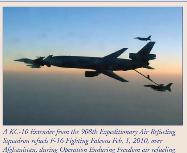
Afghanistan, during Operation Enduring Freedom air refueling operations.

The Department's top mission priority today is to support current operations, and DoD Components should focus their operational energy investments accordingly. The Department also has a duty to ensure the future security of the Nation, making planning and force development an important operational energy focus, as well. The Department has an interest in long-term national energy security and should take steps to work with other Federal agencies and the private sector to diversify and secure fuel supplies. Finally, operational energy is an important tool for strengthening U.S. Alliances and partnerships with other nations, a key strategic goal for the Nation.