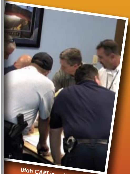
Utah CART in action, September 13, 2008