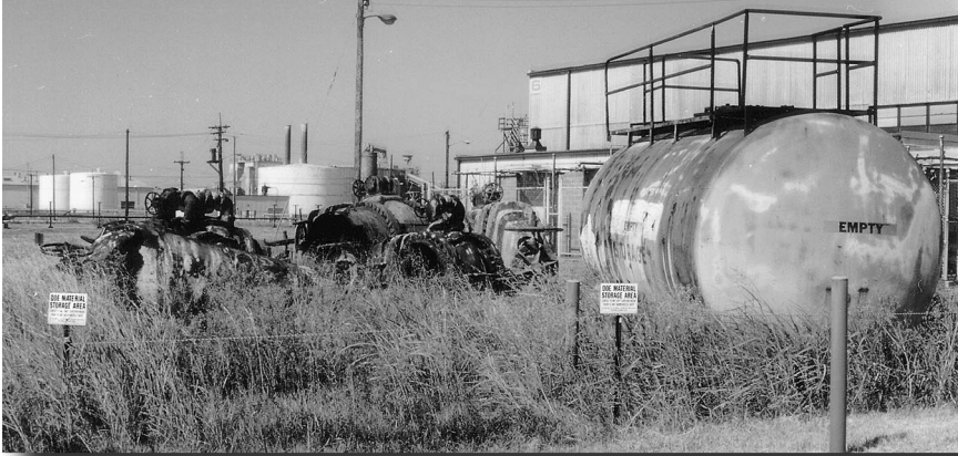
Figure 2: Examples of Storage Areas for Waste and Scrap Metal That Were Left Out of Paducah's Cleanup Plan