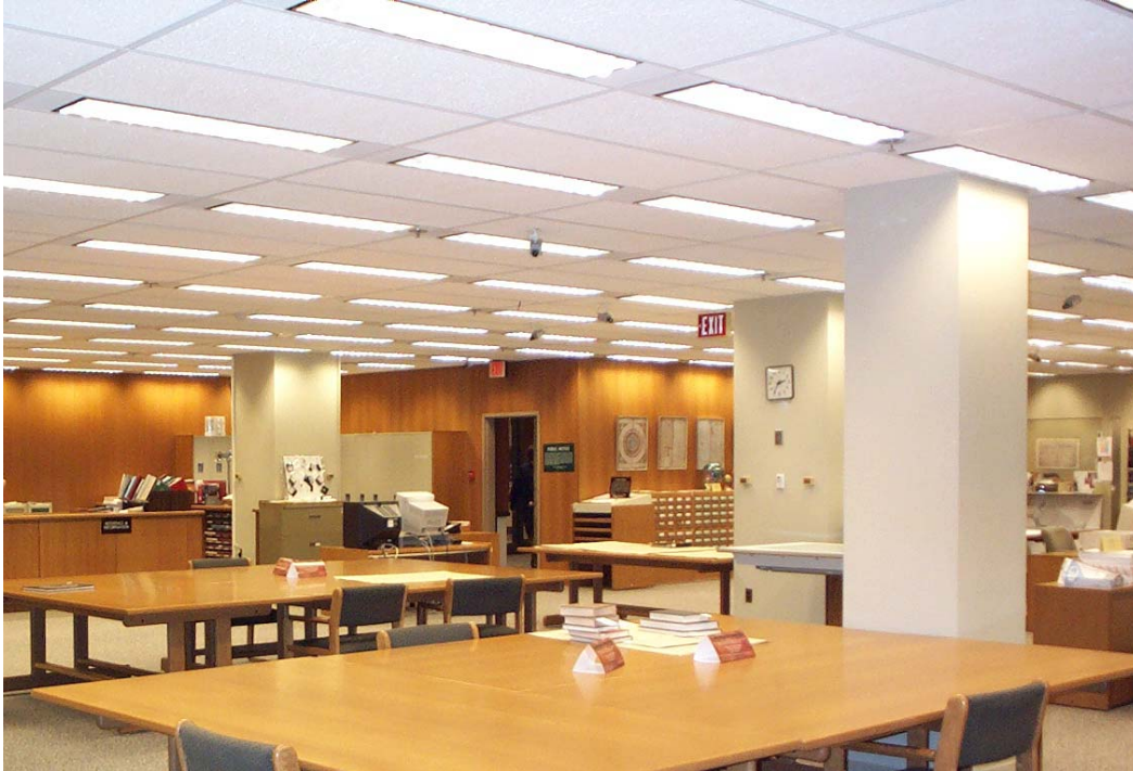
Figure 2. Geography & Map Reading Room - November 24, 2003

In 1999, the Library formed the Reading Room Use Statistics Committee to address statistics for all of the Library’s reading rooms. The committee made recommendations regarding consistency issues, periodic sampling, and the need for all reading rooms to conduct hourly reader counts. The Committee also reported that there was an assumption that lower statistics would result in fewer resources and that staff in a few reading rooms had devised methods of counting that could be characterized as “unrestrained.”