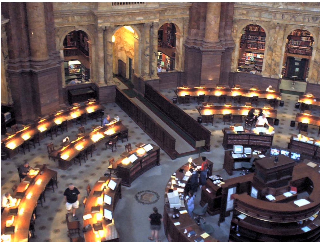
Figure 1. Main Reading Room - August 13, 2003

The reading rooms vary in size and the type of equipment required by patrons to perform research. Many have computer workstations that are available for catalog, database, and Internet searching while others contain special equipment for copying large maps, viewing and printing the Library's approximately 6 million microform items, and other uses. Figures 1 below and 2 (next page) show digital images of the Main and Geography & Map reading rooms respectively.