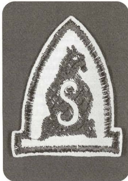
Soldiers of the Thirty-first Infantry Regiment adopted a shoulder patch featuring a black bear with an "S" (for Siberia), to distinguish themselves from AEF units in North Russia.