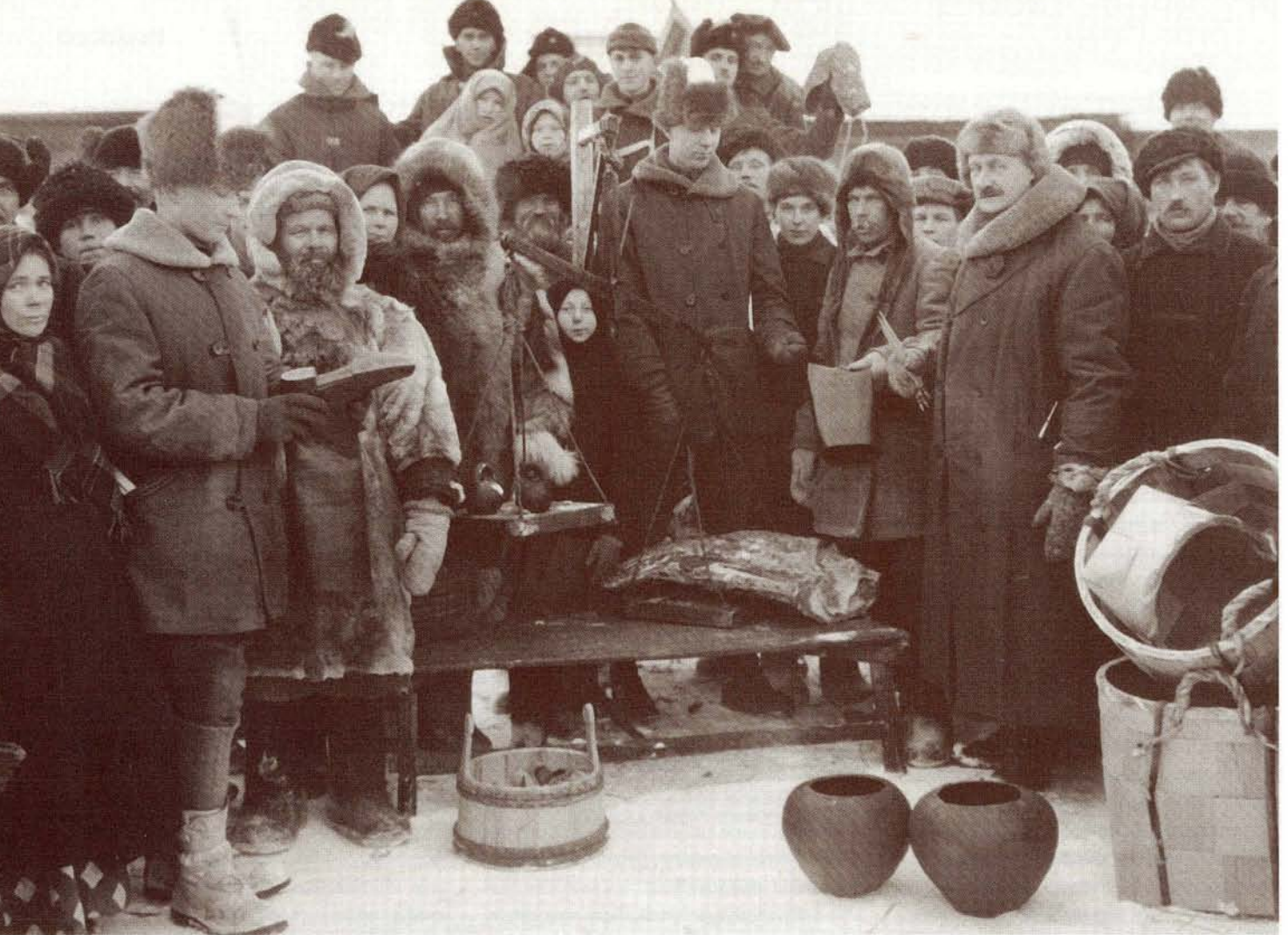
American officers of Co. F, 339th Infantry, visited the marketplace at Emetskoe, outside Archangel. The villagers offered clothing as well as food that included borsemeat (on wooden scale), carrots, and potatoes.