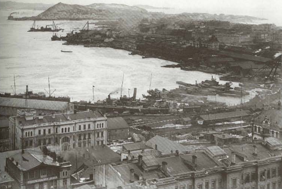
Vladivostok's extensive port facilities and Trans-Siberian Railroad terminus served as the base for Allied forces in Siberia, including the ten thousand American troops that served there until 1920.

ducting the trial, the proof necessary to convict a soldier of an offense, and the legality of considering certain testimony or evidence.