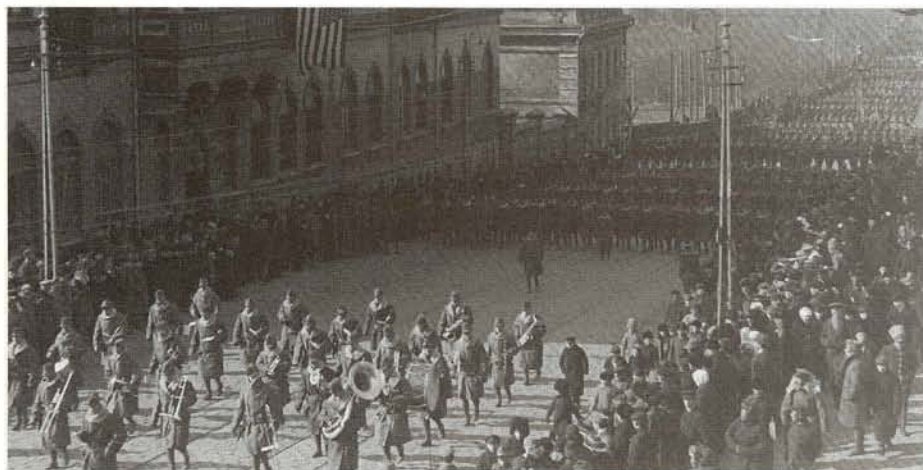
A peace parade in Vladivostok on November 15, 1918, included the American forces’ Thirty-first Infantry band.