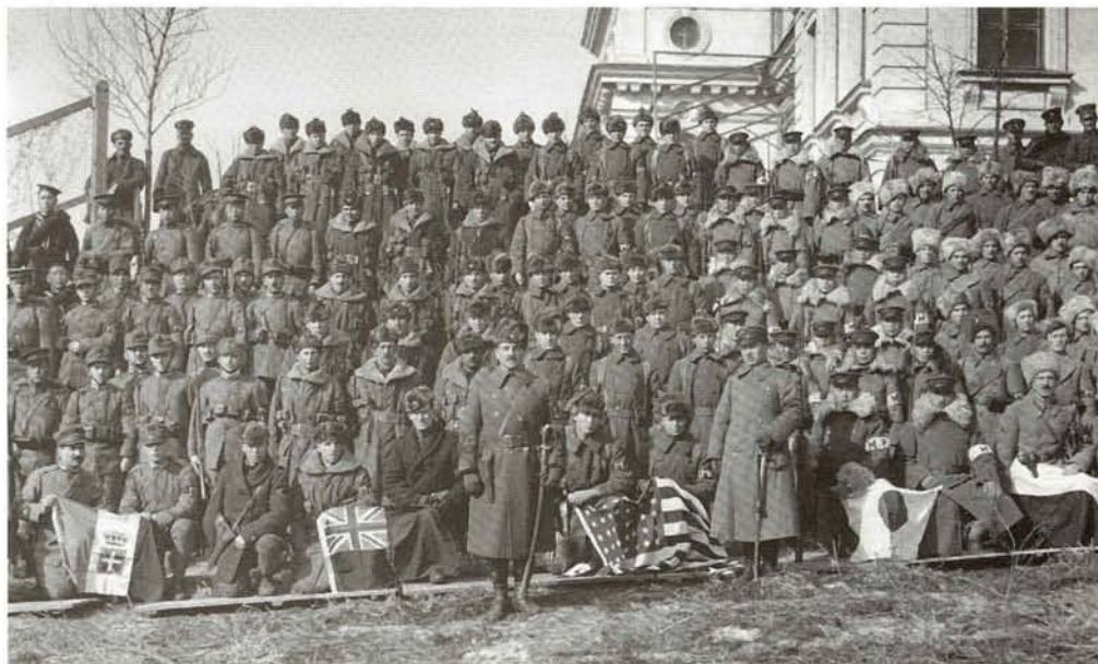
The Allied forces in Siberia were composed of British, French, American, Japanese, and Czech troops. Many of them hoped for a non-Communist victory in Russia.