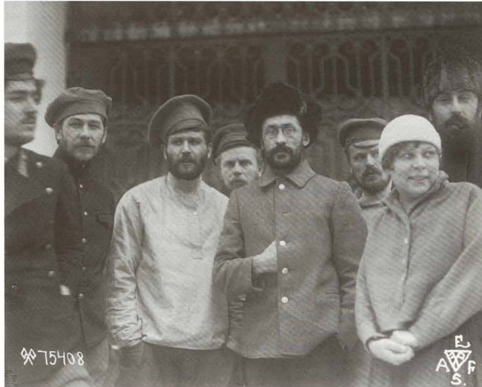
Tomsk Bolshevik officials, after capture by the Czechs at Ekaterinburg, included (from left) the town secretary, chief justice, town commissaire, and stenographer. They were soon executed.

accused soldier had not been violated. He recommended corrective action, if necessary. As no court-martial had legal effect until its judgment was approved by the commander who had convened the court, a judge advocate might suggest to this commander that part or all of the findings of guilty be disapproved, or that the sentence be modified in some manner. Consequently,