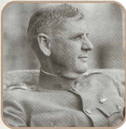
Maj. Gen. William S. Graves commanded the American Expeditionary Forces in Siberia from 1918 through 1920.

While a judge advocate spent the vast majority of his time administering the army's criminal legal system, his duties also required him to provide personal legal