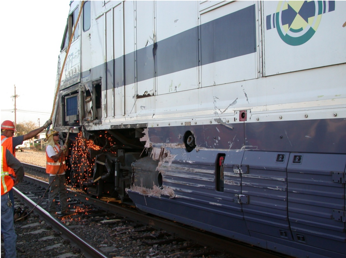
Figure 3. Metrolink employees making minor repairs to damaged side of Metrolink locomotive.

when the train was taken to Metrolink's mechanical facilities. The postaccident equipment inspections and airbrake tests did not indicate any defects that would have caused or contributed to the collision.