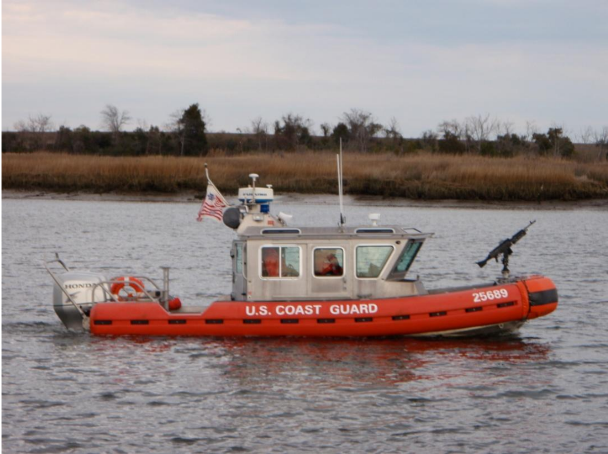
Figure 1. The CG 25689.