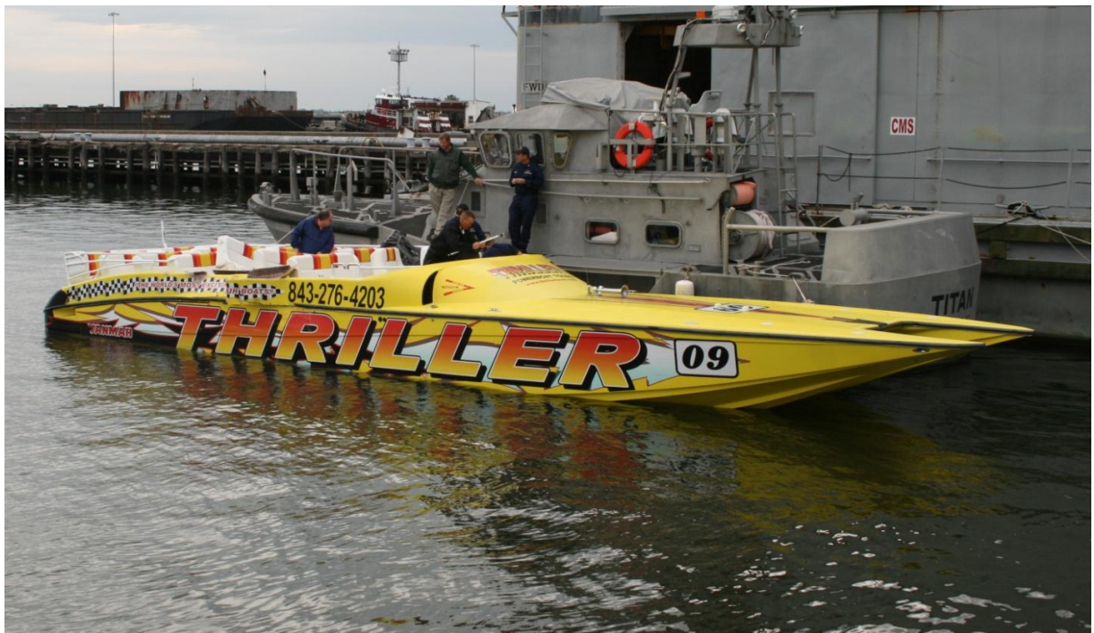
Figure 2. Profile view of Thriller 09 postaccident.