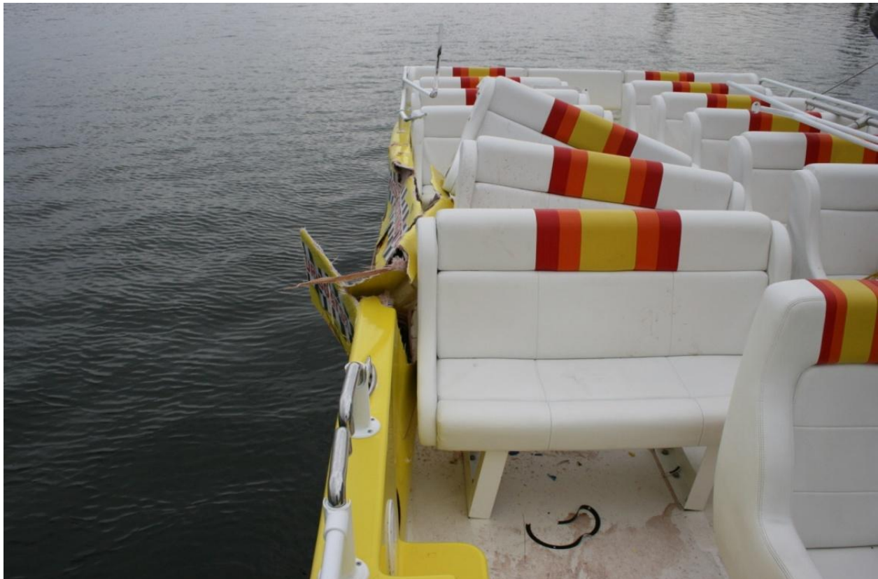
Figure 5. Damage to Thriller 09 starboard side, looking aft from the bridge.

Damage. The Thriller 09 sustained damage primarily to the starboard-side hull, above the waterline (figure 5). The damage in the impact area consisted of scratched, cracked, broken, and detached portions of the fiberglass hull shell, as well as fracturing of the interior hull framing and deck in this area. As a result of the collision, the starboard passenger bench seats at rows 2 and 3 were lifted and partially detached from the deck. The damage began 29 feet 7 inches from the bow and extended aft 12 feet 9 inches. According to the attorney for the boat owner/operator, the damage repair cost totaled $94,300, excluding transportation and storage costs associated with shipping the boat to a Florida repair facility.