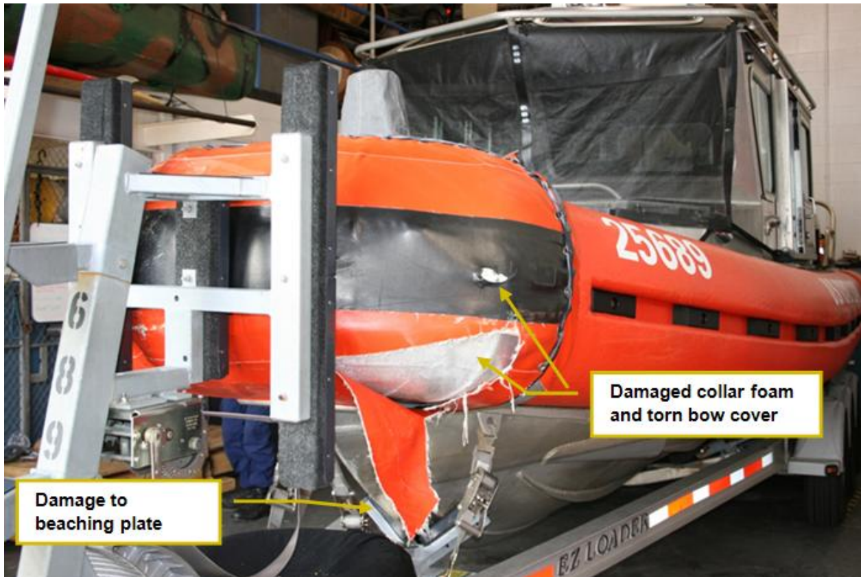
Figure 6. Damage to the CG 25689's bow collar foam, bow cover, and beaching plate.