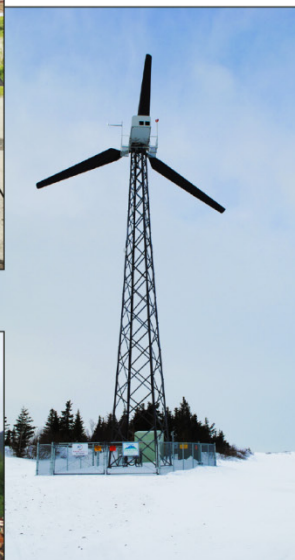
A village wind turbine.