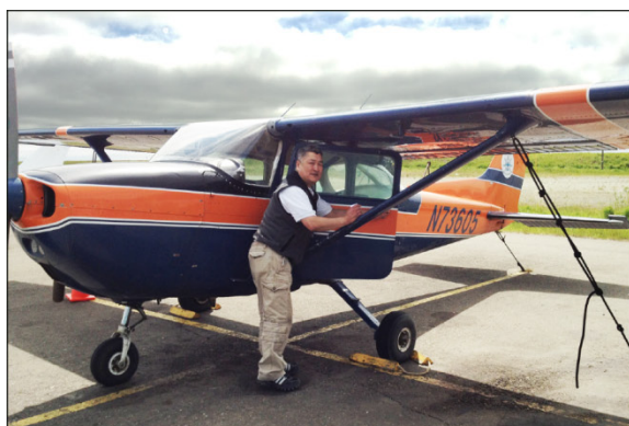
Flight school training aircraft.