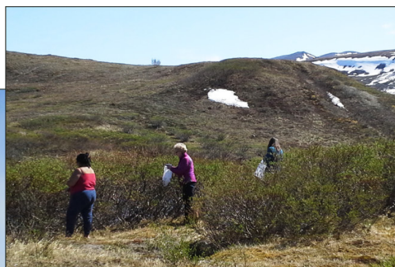
Harvesting willow leaves on corporation-owned land.