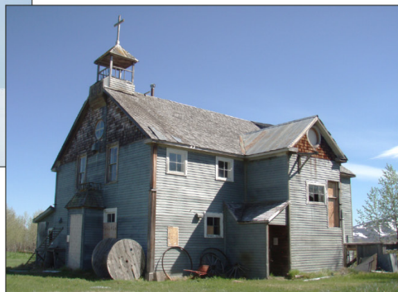
Protected historical mission site.