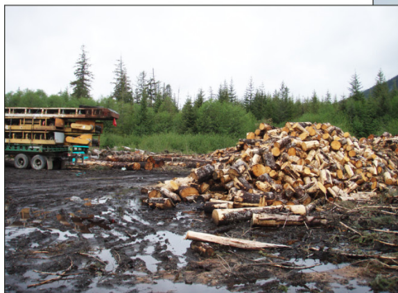
Firewood ready for distribution.