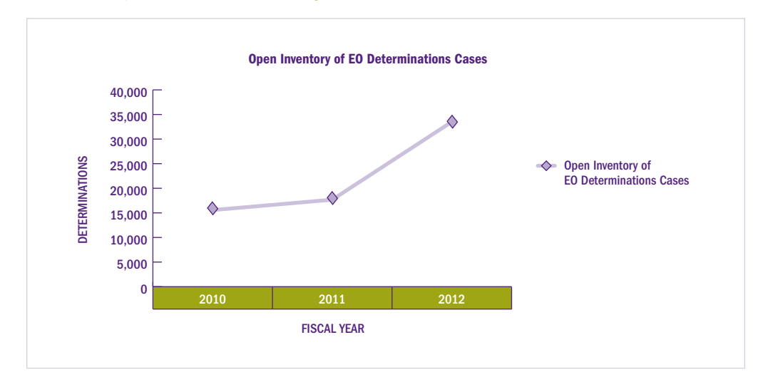
FIGURE 1.11.2, EO Determinations Inventory<sup>20</sup>

The consequence of the increased volume in applications handled by the same (or slightly smaller) Cincinnati Determination staff has been an increase in EO's inventory of open ( i.e. , unresolved) cases, as shown in Figure 1.11.2. The expected volume of open inventory for FY 2012 is more than double the FY 2010 level, increasing from 15,570 cases in FY 2010 to 33,505 expected in FY 2012.