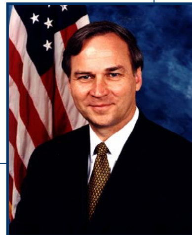
J. Randy Forbes Member of Congress

A handwritten signature in blue ink that reads "J. Randy Forbes".