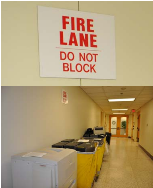
Figure 4: Example of excess IT equipment left in public hallway.

process reduces the future utility of useful equipment to schools and nonprofit organizations.