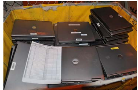
Figure 3: Excess computers awaiting hard disk sanitization before donation to the Computers for Learning program.