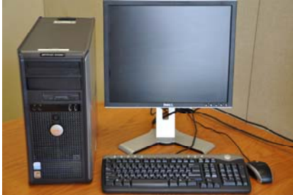
Figure 1: Example of a standard IT workstation.

The Library of Congress relies heavily on its information technology (IT) infrastructure to effectively support the Congress and provide services to the American people. Major parts of the infrastructure are the IT workstations used by Library staff and visitors. These workstations include desktop and laptop/telework computers, computer monitors, and core software such as Microsoft Corporation's Office, the required software used throughout the Library for standard office productivity functions.