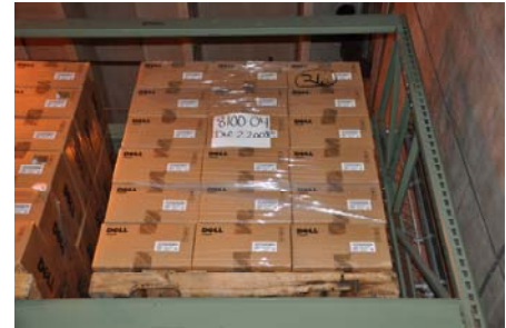
Figure 2: Example of new IT equipment that has remained in storage since December 2008.

In our view, ISS could address this situation by consistently using the FIFO method of distributing IT equipment from inventory. Such methodology is a best practice, and at a minimum, its implementation by ISS would help prevent sizable accumulations of older IT equipment items in storage.