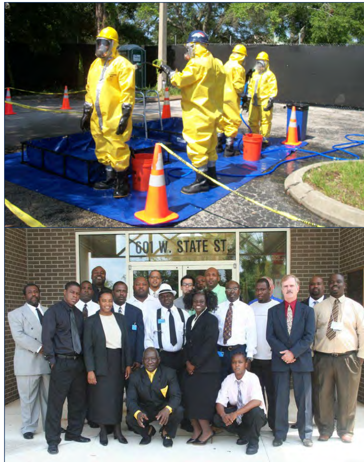
Below: Graduates from Florida Community College at Jacksonville’s Job Training Program Above: Jacksonville’s Job Training Class # 3