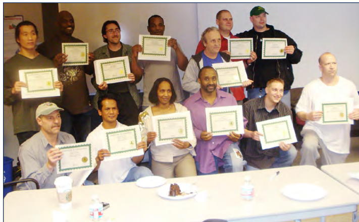
Graduates of King County Washington Jobs Initiative

King County, Washington — In Washington State, the King County Jobs Initiative (KCJI) helps formerly incarcerated County residents move beyond the stigma of jail time and into living-