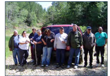
Students of Fort Belknap's job training program

Building on these and other efforts in the remote mountains, plains, and tribal territories of EPA's Region 8, the Brownfields Office