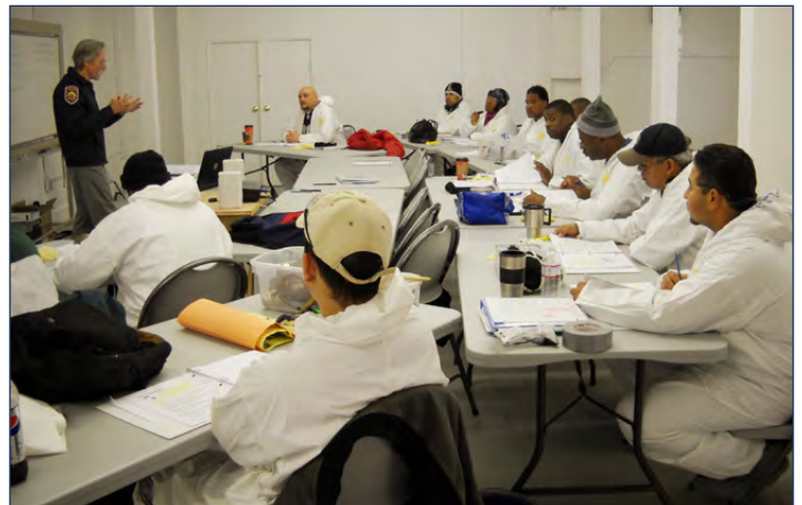
Students in Richmond, California's Job Training Program

Earlier this month, 5 graduates of the program were hired by Global Diving, a private firm providing skilled technicians to clean up the BP Gulf Oil Spill. Those