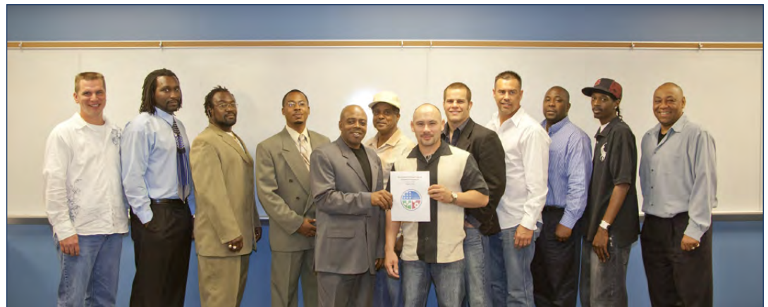
Brownfields Job Training Graduating Classes from St. Louis, Missouri