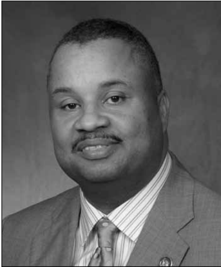
Donald PAYNE JR.