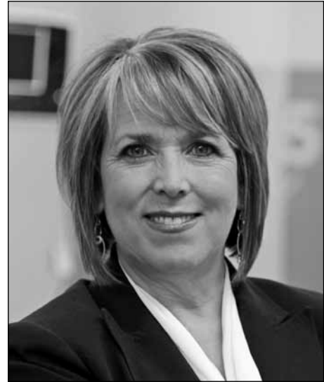
Michelle LUJAN GRISHAM