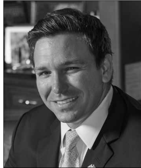
Ron DE SANTIS