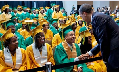
President Obama congratulated Booker T. Washington High School's class of 2011.