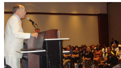
Congressman Cohen spoke at a Small Business Forum he hosted at the University of Memphis in August.