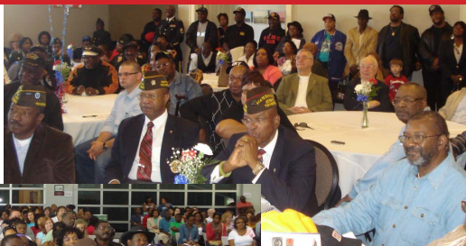
Three hundred constituents attended Congressman Cohen's Annual Veterans Luncheon at The Links at Whitehaven in November to learn more about veterans legislation.

I cosponsored a bipartisan law that had wide support from business groups that eliminated a regulation that would have required businesses that purchase more than $600 of goods or services to submit a 1099 tax form to the IRS. Ending this bureaucratic regulation will help small businesses create jobs.