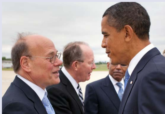
Congressman Cohen greeted President Obama at Memphis International Airport.

President Obama selected Booker T. Washington High School as the winner of the Race to the Top High School Commencement Challenge. In May, the President visited Memphis to deliver a truly inspirational commencement speech. Before the speech, the President and I met together with families affected by recent flooding. After the speech, the President and I returned to Washington on Air Force One while dining on Memphis BBQ.