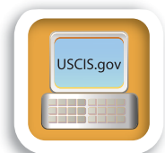
Check the status of your request online