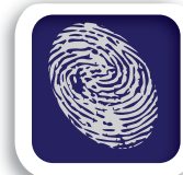
Visit your local USCIS Application Support Center for a scheduled biometrics services appointment