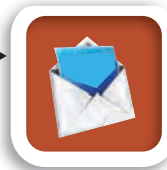
Mail USCIS forms and fees