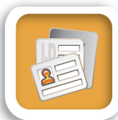
Collect documents as evidence you meet the guidelines