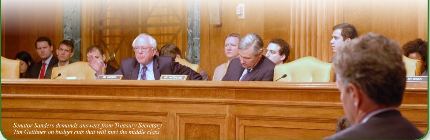
Senator Sanders demands answers from Treasury Secretary Tim Geithner on budget cuts that will hurt the middle class.

Bernie believes that deficit reduction is extremely important, but that it must be done in a way that requires “shared sacrifice.” This is especially true considering that while the top one percent is doing extremely well, their tax rate is the lowest in decades. With the U.S. facing a $15.6 trillion national debt and huge unmet social needs, Senator Sanders is fighting to make sure that the wealthiest people and the largest corporations begin paying their fair share of taxes. He also believes that, with the United States now spending more on defense than the rest of the world combined, we must take a hard look at excessive military expenditures.