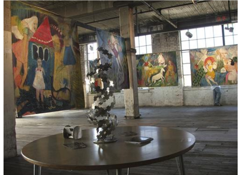
Dubuque, IA Warehouse District Exhibit

The next deadline will be in March 2013.