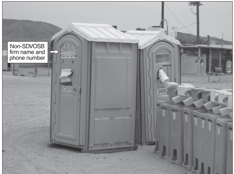
Figure 1: Case Study 5 Firm's Portable Toilets and Hand-Wash Stations with Non-SDVOSB Name and Phone Number