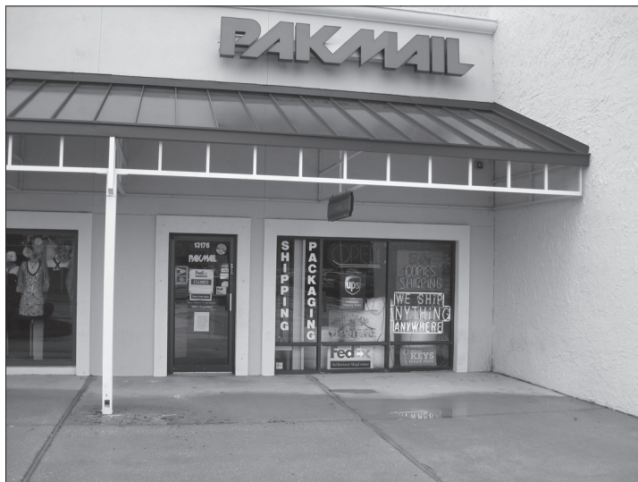
Figure 2: Business Mailing Address and Physical Address for Case-Study 10 Firm

contract. Our investigation found that the owner of the SDVOSB passed through all of the work for this furniture design and installation contract to a furniture dealer that his wife worked for, who then passed the work to a furniture manufacturer that actually designed and installed the furniture. When we interviewed the SDVOSB firm owner, he admitted that he had no experience in the furniture business. In addition, the SDVOSB owner works full-time at MacDill Air Force base—the same location as the contract award. This award is questionable on three counts: the SDVOSB owner’s full-time job with another employer should make it impossible for him to manage and control daily business operations on a large SDVOSB contract; the contract work was passed through to the manufacturer; and the owner’s daily interactions with Air Force personnel on base create the perception of preferential treatment. In addition, as shown in figure 2 below, the legitimacy of the SDVOSB firm is also in question because the firm’s physical address is the owner’s home and its mailing address is a mail-box rental store.