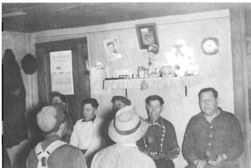
1. The Salt Creek Singers, a mutual aid society at Tonawanda.