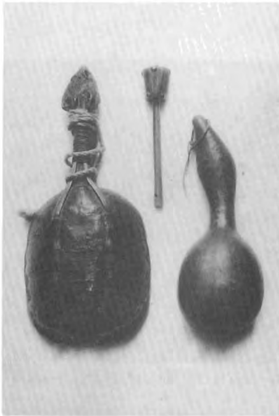
1. Turtle, horn, and gourd rattles. (Collected by J. N. B. Hewitt at Six Nations Reserve, Canada, for the U. S. National Museum.)