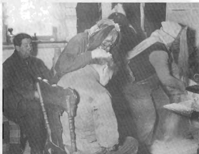
2. While dancing, the False-faces doctor their grandchildren by blowing hot ashes