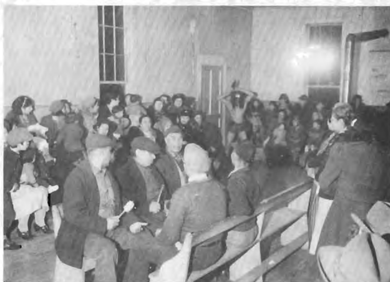
2. The Women's Dance is interrupted by a False-face beggar.