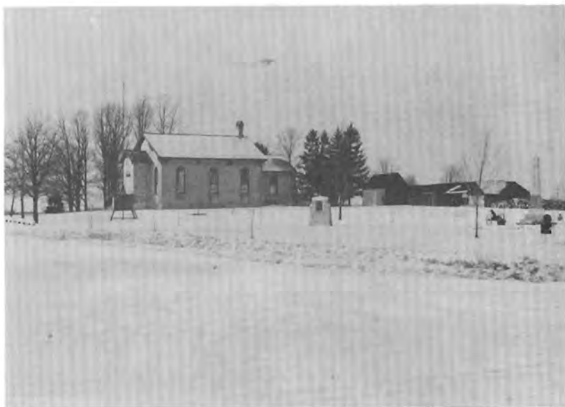
1. Courthouse of the Six Nations at Ohsweken, Canada.