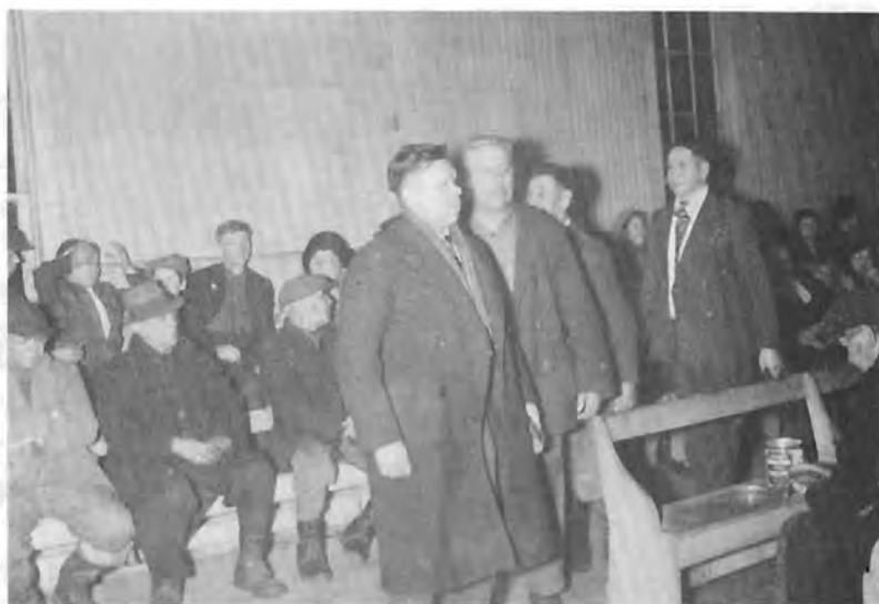
1. The Bear Society renews its ceremony.