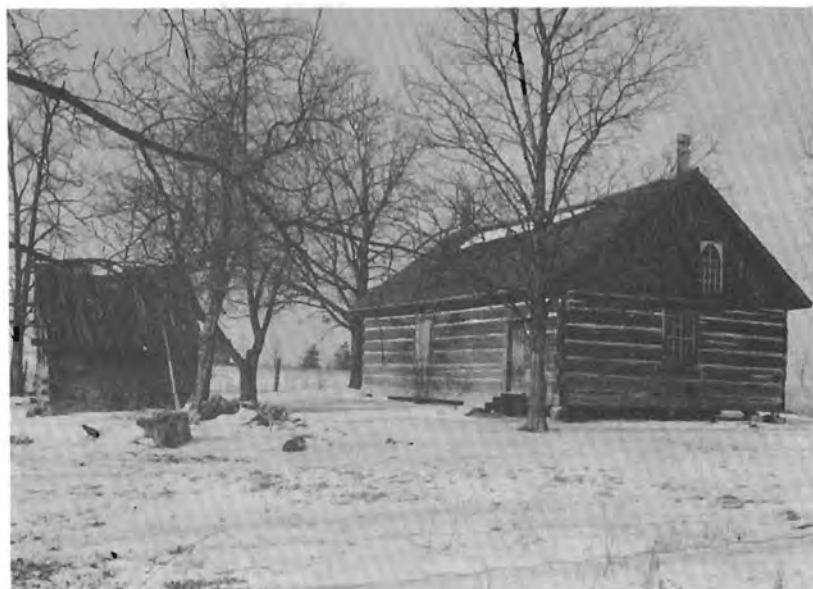
2. The old log longhouse of the Upper Cayuga band at Sour Springs, Six Nations Reserve, Canada.