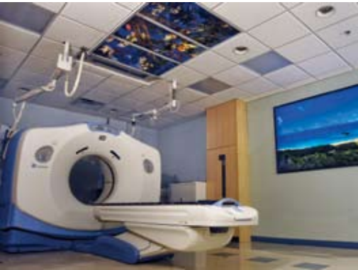
The dedicated GE-Varian LightSpeed CT simulator will improve treatment planning and outcomes for patients at JJP VAMC.

on the table and receive a tightly targeted dose of treatment, and the clinic is able to deliver treatment more efficiently.