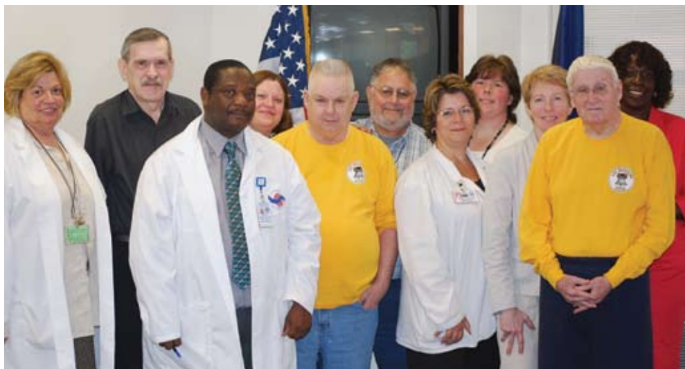
Cultural Transformation Committee members at the Montrose campus

Perhaps the most important component of cultural transformation is the recognition that Veterans have greater control over their lives in the CLCs. This shift in thinking includes decisions on when to get up, when to go to sleep, what activities to participate in, how to spend time, food choices and more. To measure success, the staff uses a quality-of-life questionnaire to offer residents opportunities to comment on the changes and share what's important to them. ■